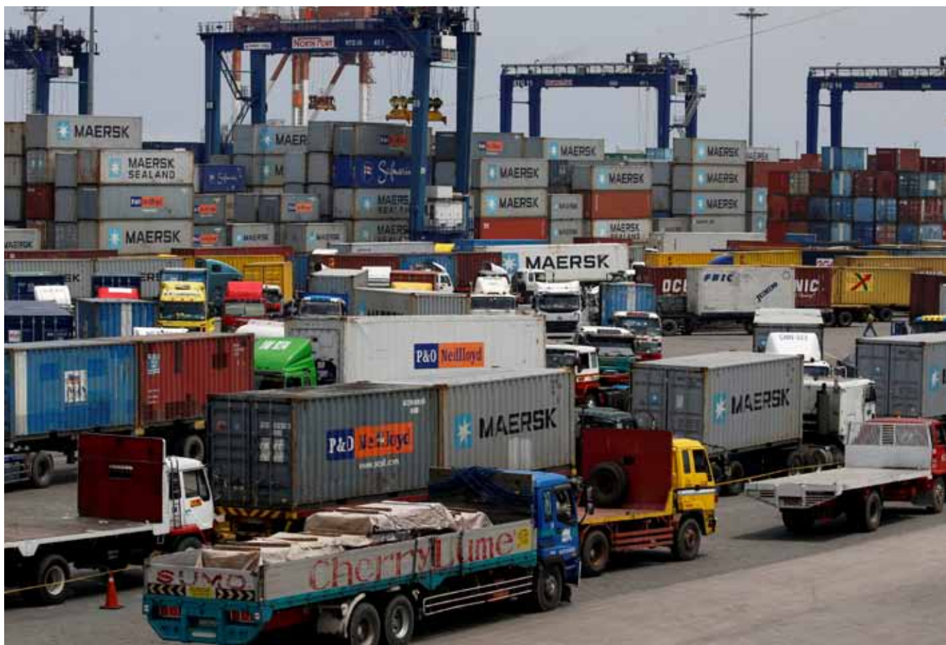
Trucks transporting containers with imported items prepare to leave a port in Manila, The Philippines, in May 2016. The complex global multiplex world will cover not only trade, but economic and ecological linkages, and transnational challenges.