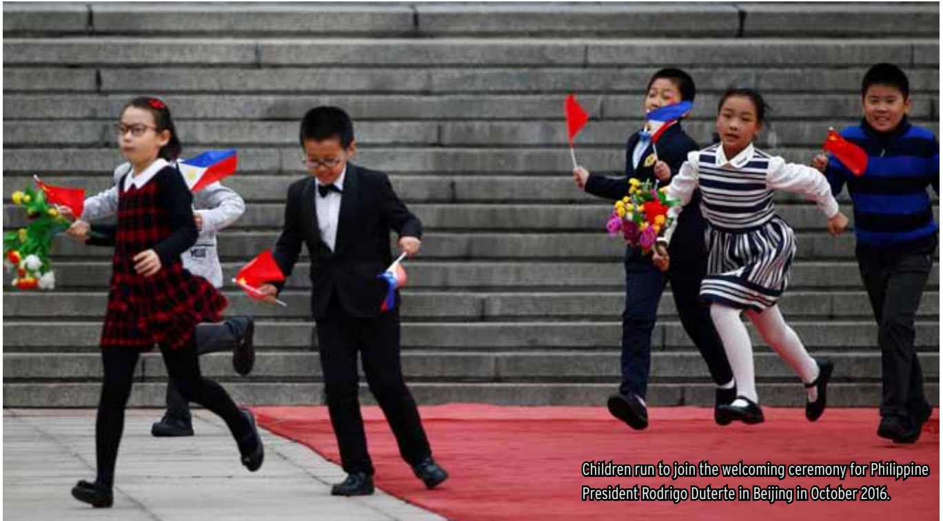
Children run to join the welcoming ceremony for Philippine President Rodrigo Duterte in Beijing in October 2016.