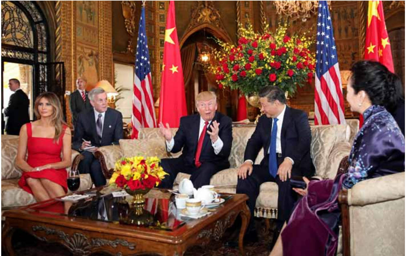
US President Donald Trump and Chinese President Xi Jinping, with first ladies Melania Trump and Peng Liyuan, at the 'informal summit' at Trump's Mar-a-Lago estate in April 2017. China now has to deal with a US leader who values 'unpredictability and tension in achieving goals'.

The Trump government's preoccupation with North Korea and China reinforced a prevailing drift in American policy in Southeast Asia. Trump and his officials have announced the end of the Obama government's 'pivot to Asia' policy and repudiated its economic centrepiece, the Trans-Pacific Partnership.