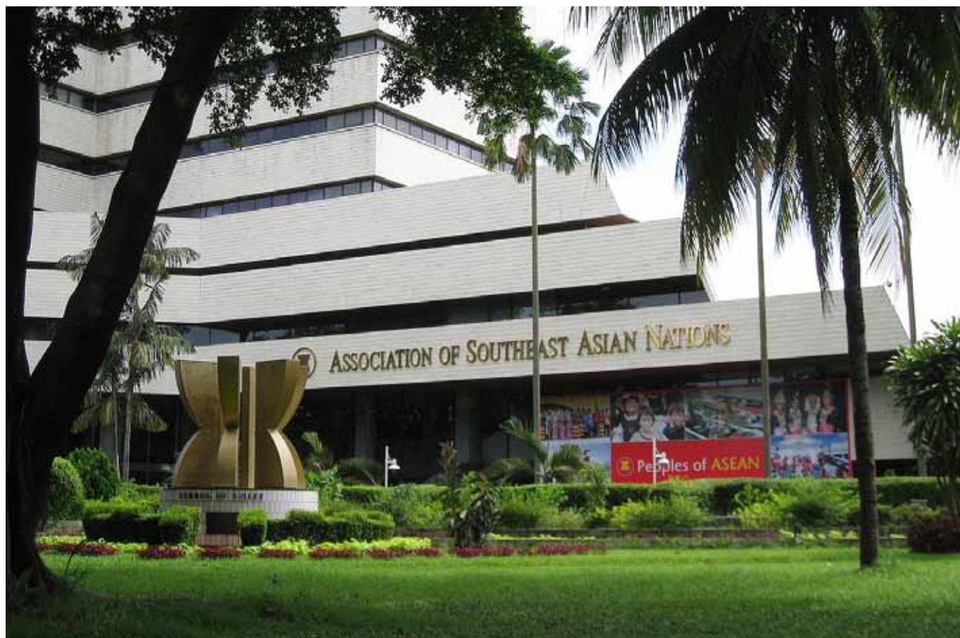
The ASEAN Secretariat headquarters in Jakarta. Today, 'network governance plays a central role in intra-ASEAN relations'.