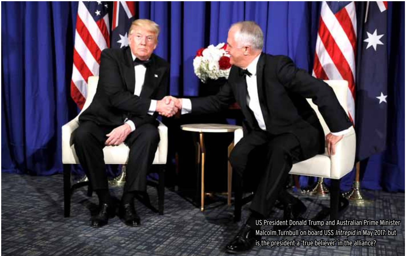
US President Donald Trump and Australian Prime Minister Malcolm Turnbull on board USS Intrepid in May 2017: but is the president a 'true believer' in the alliance?