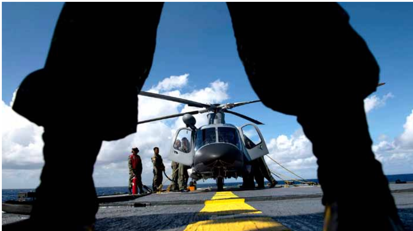
Philippine Navy personnel prepare a helicopter for takeoff during exercises with the US Navy. Uncertainty about US policy has played into Beijing's hands.

China, these countries have vital stakes of national security and sovereignty in these disputes. How the disputes are solved could substantially affect their economic development.