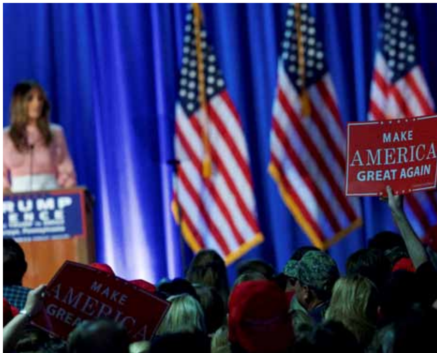
A supporter holds aloft a 'Make America great again' placard at a campaign rally addressed by Melania Trump in Berwyn, Pennsylvania, in November 2016. But the Trump administration is 'unlikely to reverse the decline of the American-led liberal international order'.

Another external challenge to the ASEAN-led architecture is the attitude and policies of the United States under the Trump administration. The new administration is unlikely to display the same interest in, and support for, ASEAN and the principle of ASEAN centrality as did the Obama administration. After pulling out of the Trans-Pacific Partnership the Trump