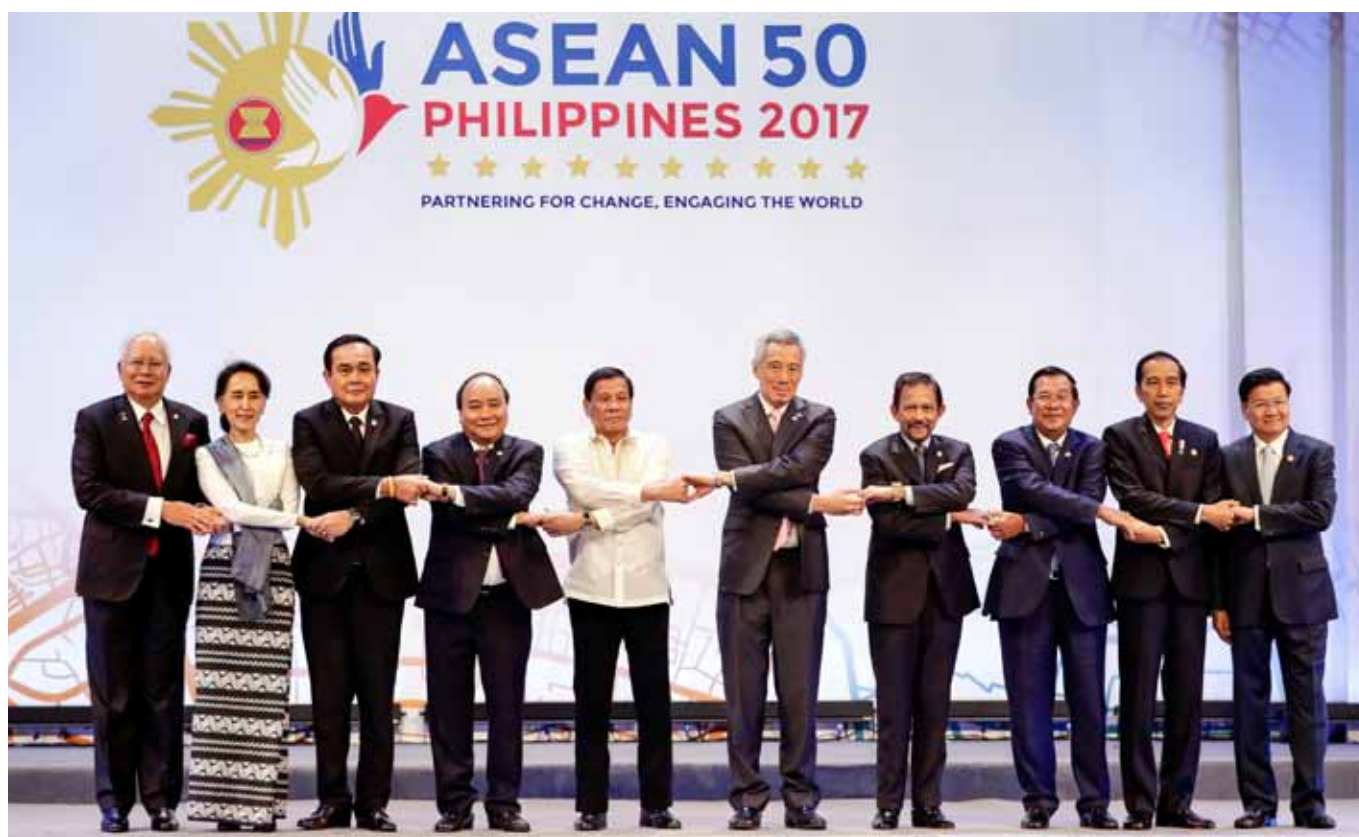
ASEAN leaders link hands at the opening of the 2017 summit in Manila. The grouping's success in forging unity in diversity is 'a beacon for our troubled world'.