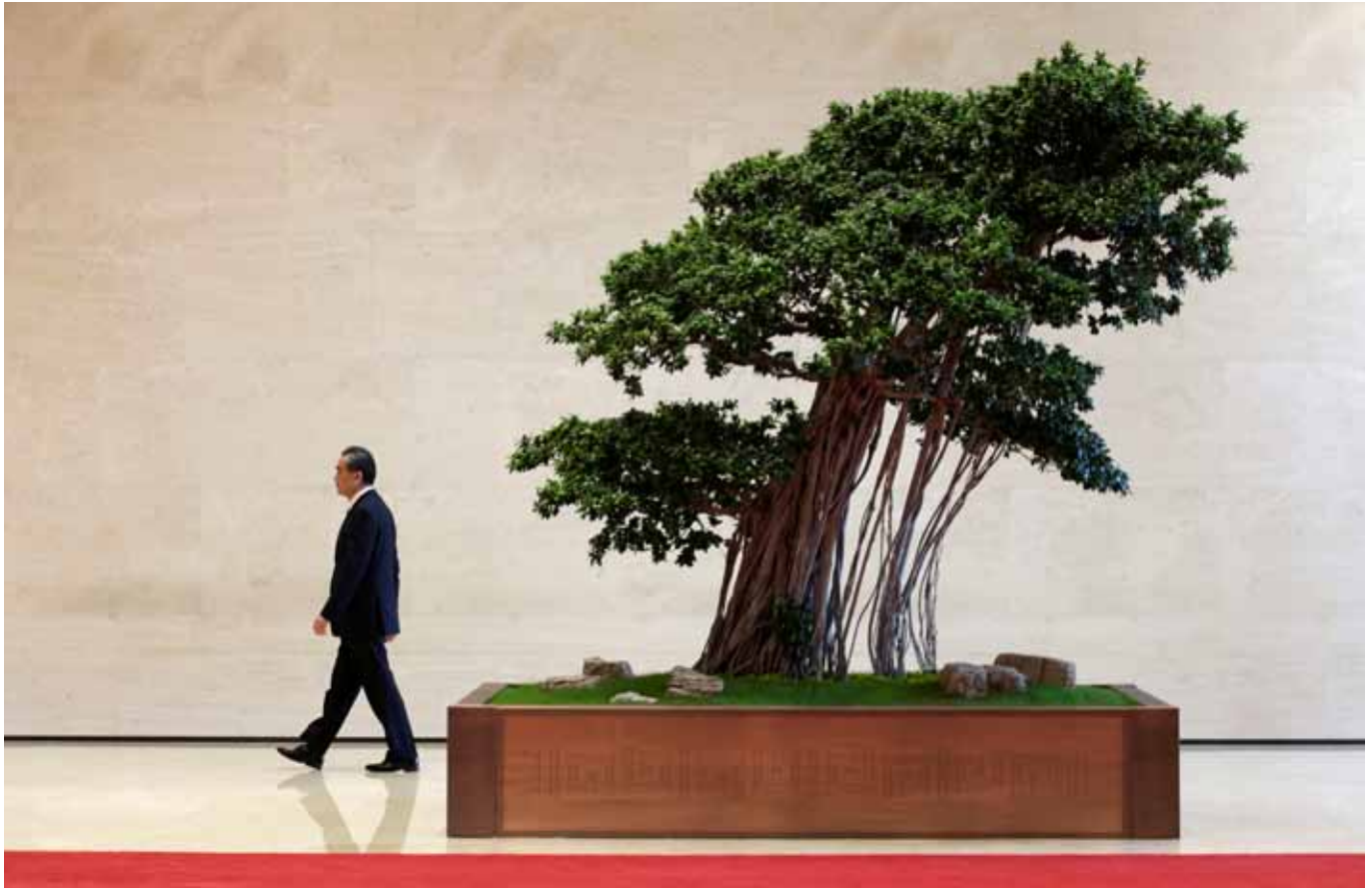
Stepping out on the Road: Chinese Foreign Minister Wang Yi outside the press conference venue to announce the conclusion of the Belt and Road Forum in Beijing on 15 May 2017. It will be hard for the initiative to achieve successful outcomes without international financial, economic and environmental safeguards.

deployed in UN peacekeeping missions. The stakes are now much higher for diplomats and the Chinese public.