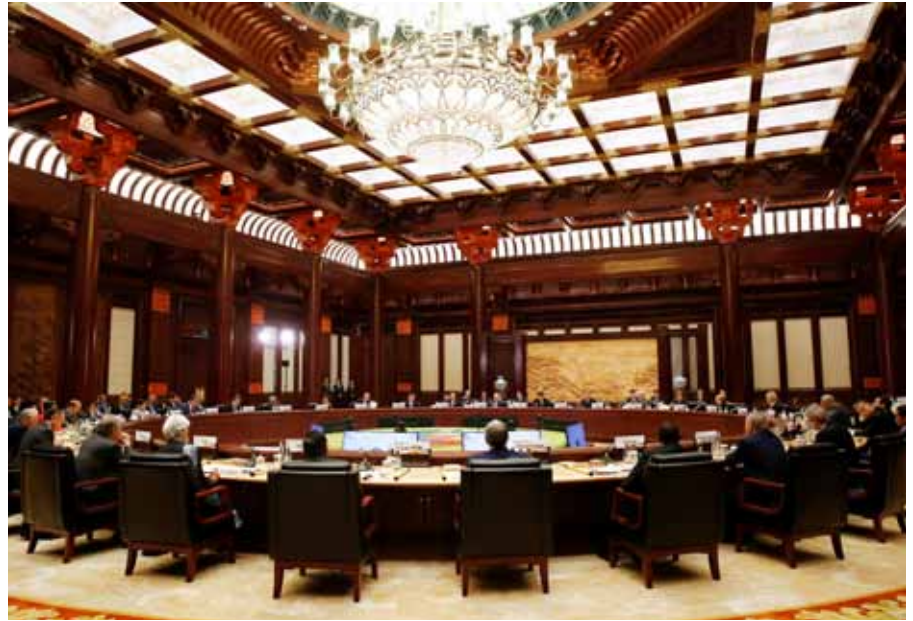
The presidents of Russia, China and Argentina, Vladimir Putin, Xi Jinping and Mauricio Macri, attended the Roundtable Summit Phase One session of the Belt and Road Forum at Beijing’s Yanqi Lake Conference Centre on 15 May 2017. The ideas underpinning China’s role in global governance are still in the making.

As China has not fully accepted the liberal international order, there are doubts about whether deeper reform can be achieved. Part of this is due to timing. China’s domestic priorities continue to trump global imperatives, and it maintains a state-guided, ideologically driven approach towards the rule of law and human rights. This will likely continue to stymie efforts to