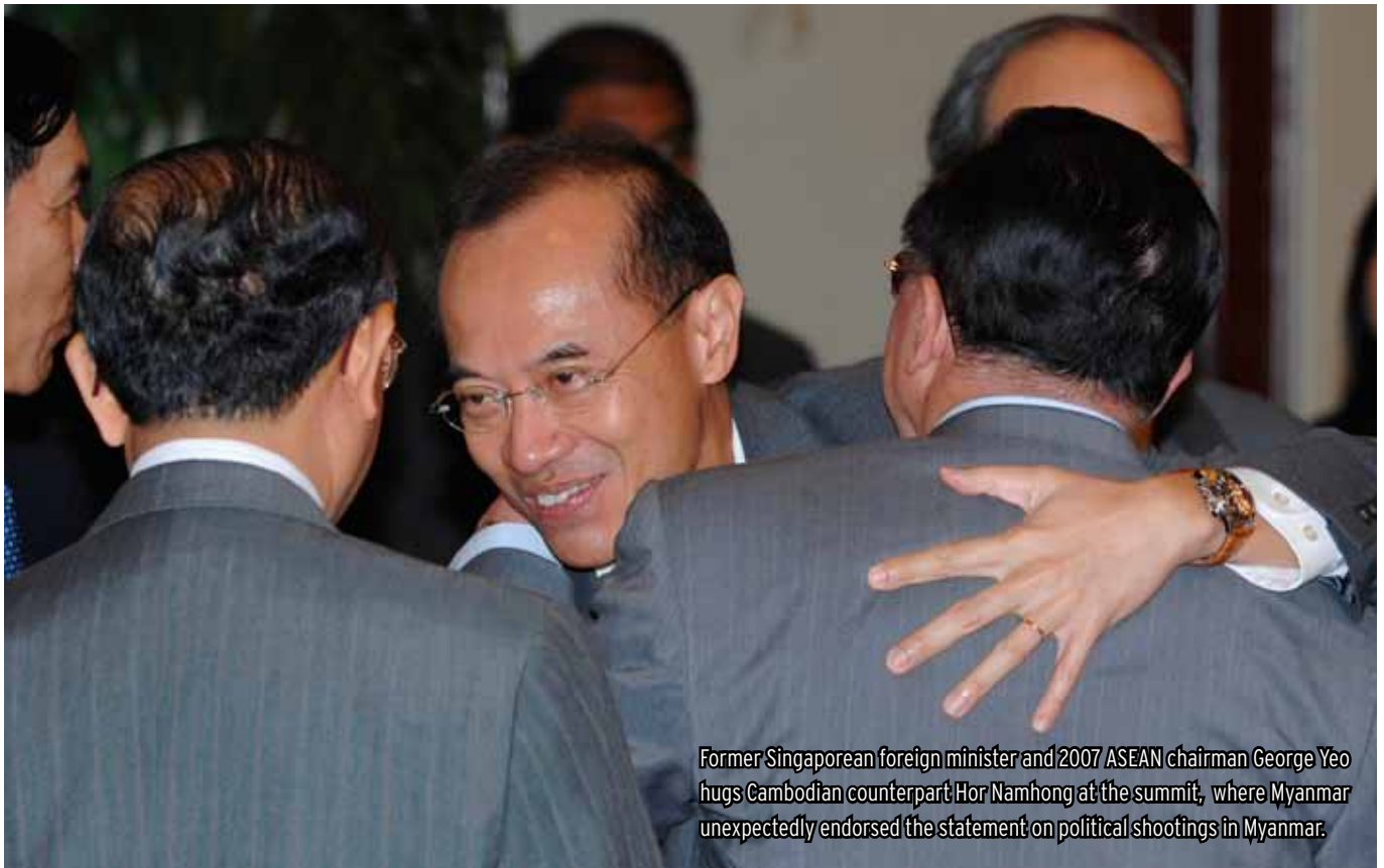
Former Singaporean foreign minister and 2007 ASEAN chairman George Yeo hugs Cambodian counterpart Hor Namhong at the summit, where Myanmar unexpectedly endorsed the statement on political shootings in Myanmar.