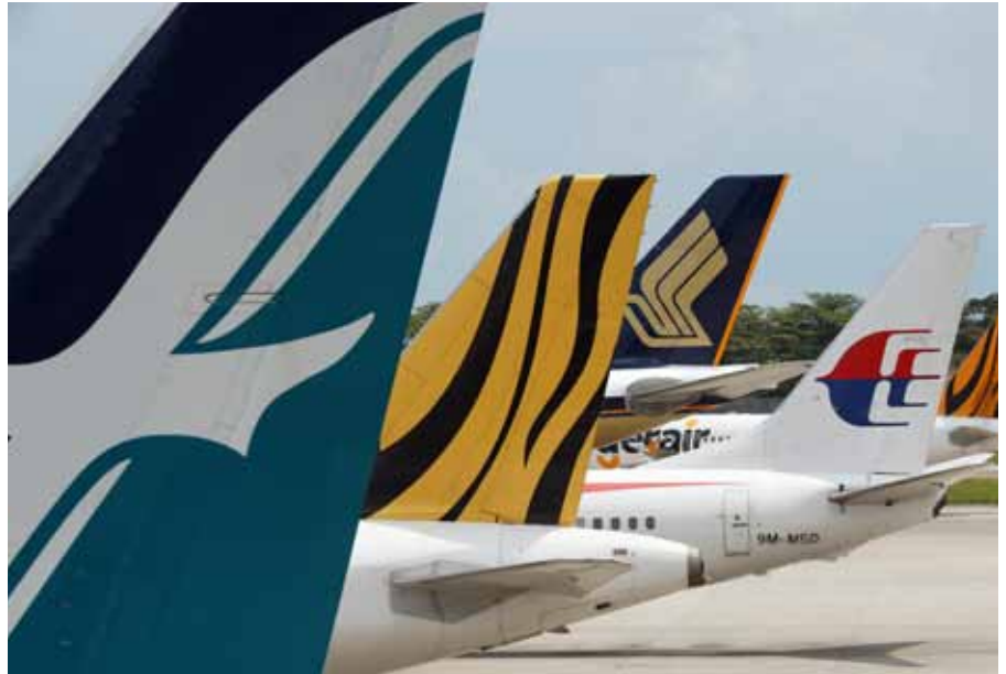
The seventh-freedom right is a key to allowing ASEAN airlines reap the benefits of China traffic.

The ASEAN situation today is comparable to that which European states faced in their earlier aviation relationship with the United States. In order to correct that asymmetry, the European Commission asked EU member states to give it the mandate to negotiate anew with the United States. As it turned out, the Commission prevailed—the EU was soon able to forge the European Common Aviation Market and to negotiate with the United States from a position of greater combined