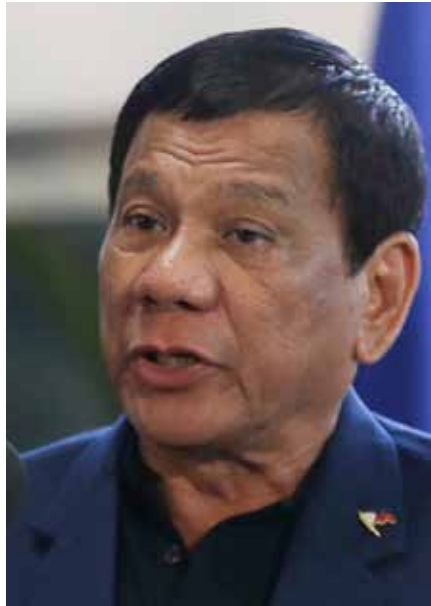
President Rodrigo Duterte: good fortune.