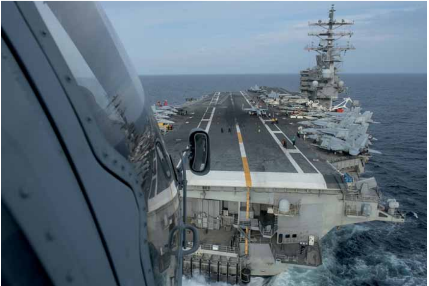
A Sea Hawk helicopter prepares to land on the flight deck of the USS Ronald Reagan in the South China Sea. In Southeast Asia during the past quarter-century, the 'dominant and fairly constant perception has been that regional stability ultimately rests upon the maintenance of American military primacy'.

isolate because they form nexuses with a range of interconnected problems—for instance, the nexus between nuclear non-proliferation, energy security and climate change.