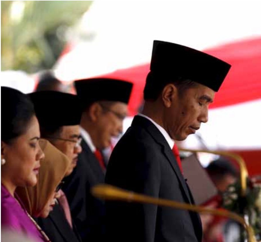
President Joko Widodo prays during Independence Day celebrations at the Presidential Palace in Jakarta. There has been no fundamental shift in the role that Islam plays in politics or foreign policy.

of the Salafist threat to Indonesia taps in to a discourse that has been present since the early 2000s about the spread of violent jihadist groups that are inspired and sometimes directly funded by Middle Eastern sources. Jemaah Islamiyah (JI), the jihadist organisation responsible for the 2002 Bali bombing that killed 202 people, was and remains aligned to al-Qaeda.