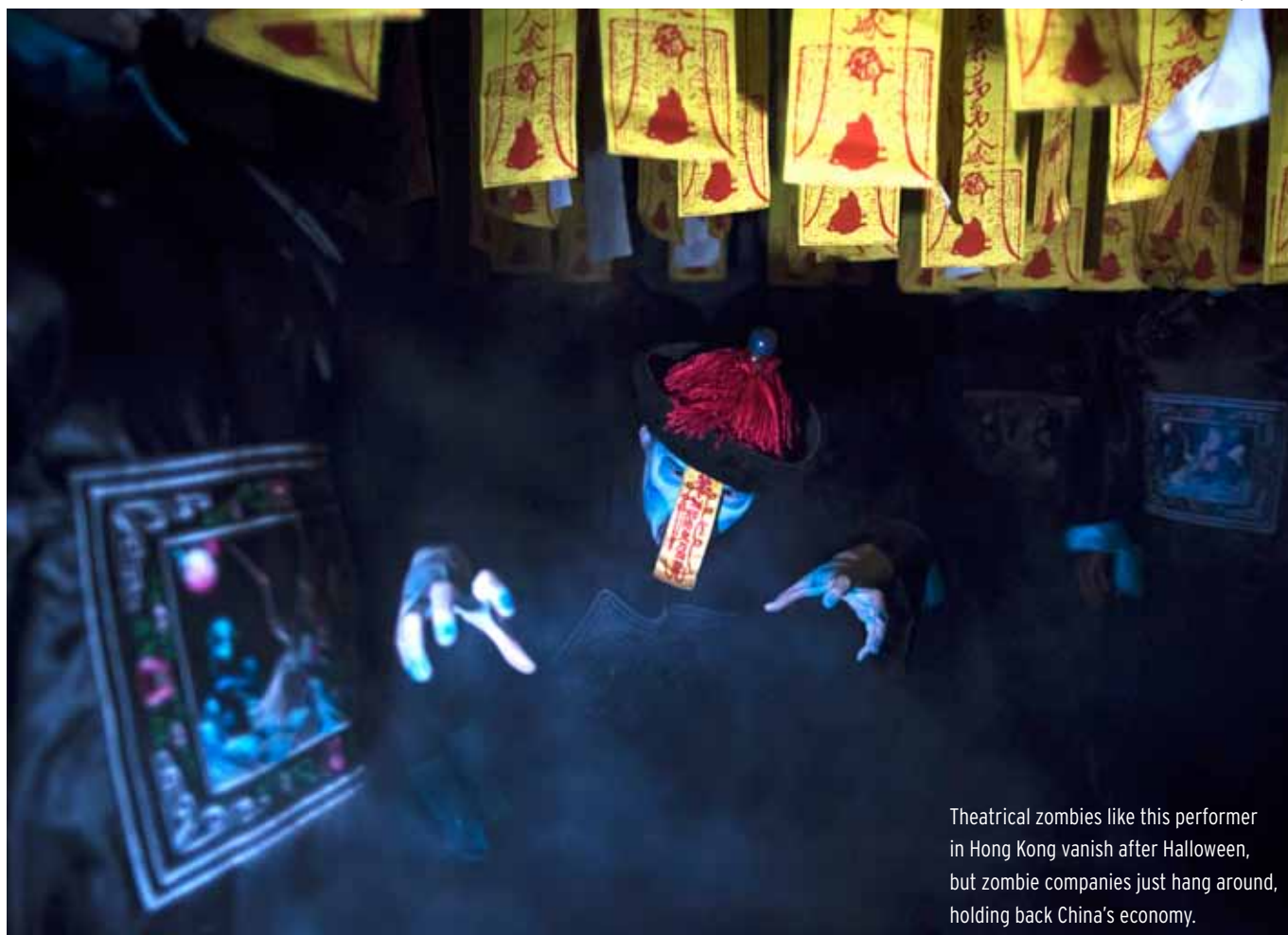
Theatrical zombies like this performer in Hong Kong vanish after Halloween, but zombie companies just hang around, holding back China's economy.