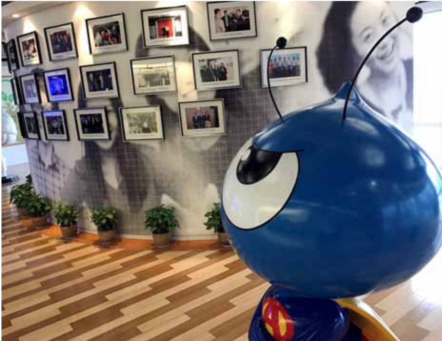
A mascot of Ant Financial at the digital finance firm's office in Hangzhou. Digital finance serves groups of customers that have been neglected by the traditional finance industry.