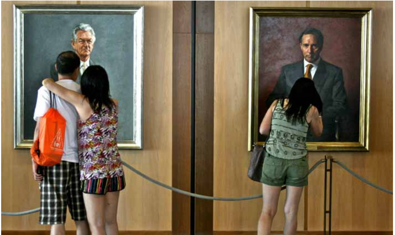
Visitors to Parliament House admire portraits of prime ministers Bob Hawke and Paul Keating. Australian politics now lacks Keating's 'overarching narrative'.

Olympics, Foreign Minister Julie Bishop addressed the Western Australian branch conference of the Liberal Party and declared, with shining eyes, that 'we crossed the line first, we won', as if it were a gold medal at stake and the margin was irrelevant.