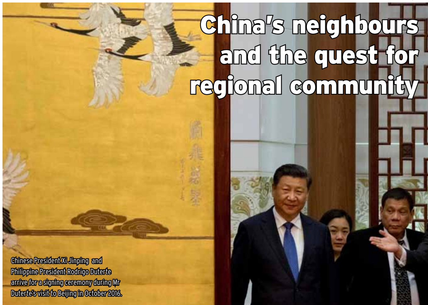
Chinese President Xi Jinping and Philippine President Rodrigo Duterte arrive for a signing ceremony during Mr Duterte's visit to Beijing in October 2016.