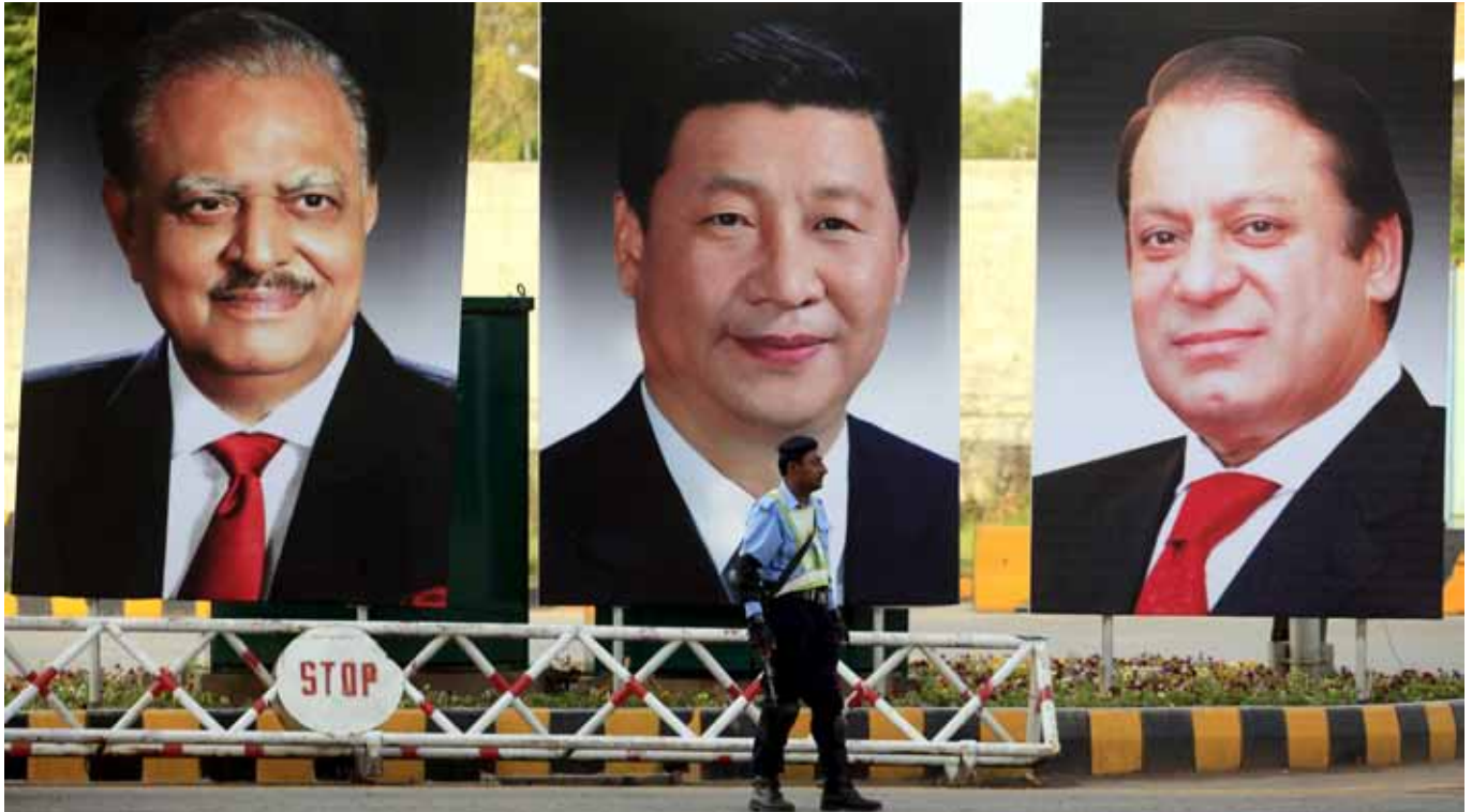
A policeman stands watch in front of roadside billboard portraits of the leaders ahead of President Xi Jinping's visit to Islamabad in April 2015.