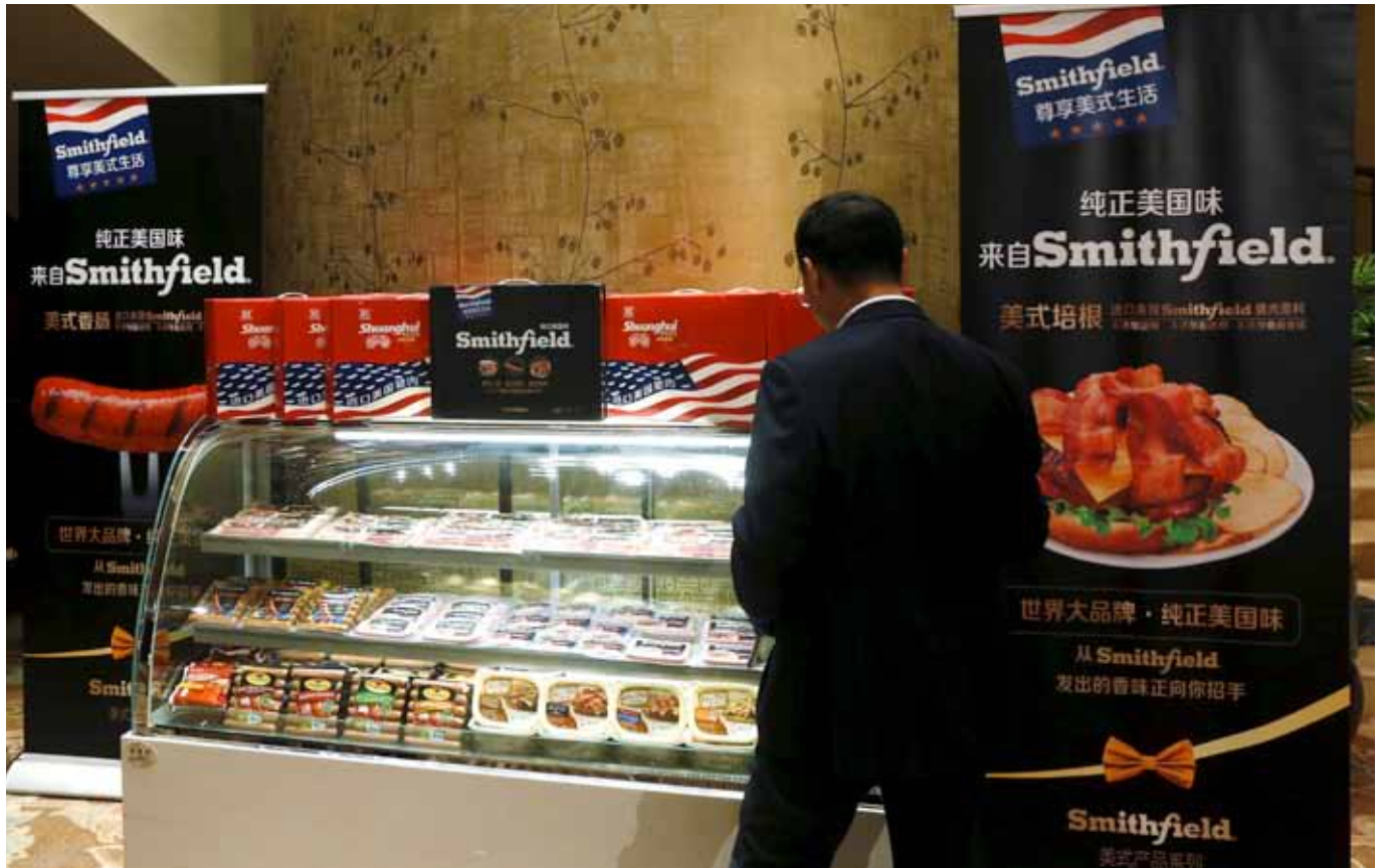
A man looks at Smithfield products at a Shuanghui news conference in Hong Kong in March 2016. The Chinese interest acquired the US meat processor in 2013.