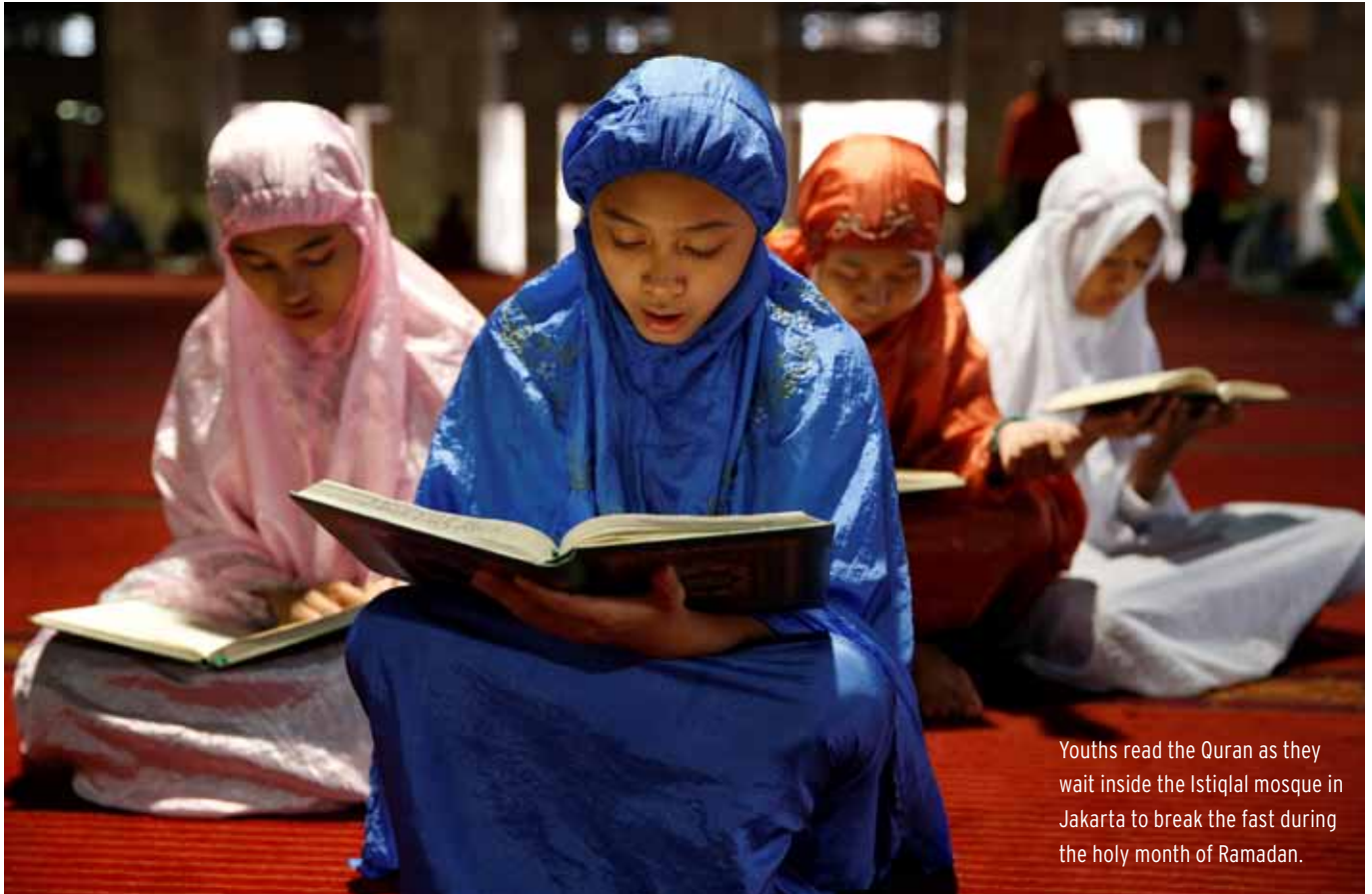
Youths read the Quran as they wait inside the Istiqlal mosque in Jakarta to break the fast during the holy month of Ramadan.