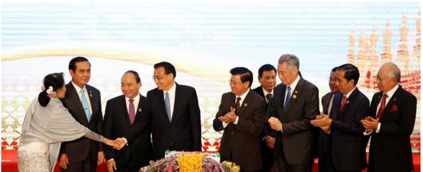
Chinese Premier Li Keqiang greets Myanmar's State Counsellor Aung San Suu Kyi during the ASEAN-China summit in Vientiane in September 2016.

China is now the world's number one trading power and has been since 2014. It is also the world's biggest exporter of manufactured goods. Chinese toothbrushes and detergents arrive safely on African and Latin American shores because the world's oceans are open to freedom of navigation and safe for commercial shipping. The US Navy is inadvertently doing the Chinese economy a big favour by keeping international sea lanes open. This has facilitated the near quadrupling of China's global trade from US$600 billion in 2004 to US$2.2 trillion in 2015.