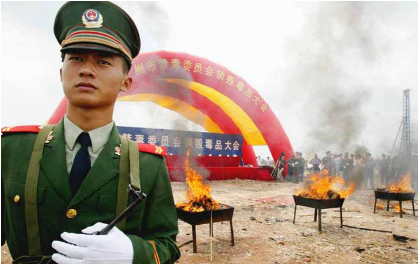
A Chinese policeman stands guard as 600 kilograms of drugs are destroyed in Guangzhou, Guangdong province. The southwestern Chinese province is a gateway for heroin traffickers from Thailand, Myanmar and Laos, who operate across 'a particularly lawless borderline'.

cartels have also been reported. This reflects the impact of the globalisation of trade and the increasing wealth of China, India and the region. Opportunities abound for expanding to new 'blue sky' industries or locations unhampered by existing protection providers.