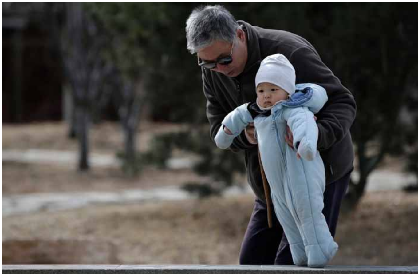
A man teaches his 10-month-old granddaughter her first steps at a residential community near Beijing. One official projection estimates that a two-child policy could increase the rate of China's GDP growth by 0.5 percentage points through its impact on aged dependency.

rural population experienced faster fertility decline from higher initial levels, compared with the trend in urban areas. This occurred despite the relaxation of the one-child policy in most rural areas to allow a second child if the first was female. This ensured that the bulk of China's demographic dividend stemmed from a surge in the rural working to non-working population ratio.