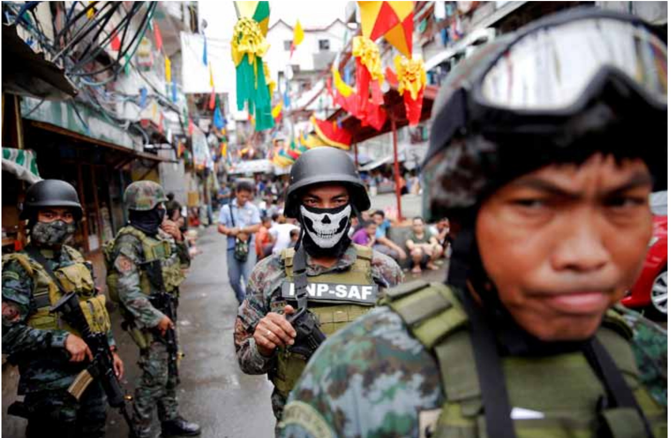
Members of the Philippines' armed forces on a drug raid in Manila in October 2016. Rather than reduce crime, hard-line policies may consolidate drug groups.