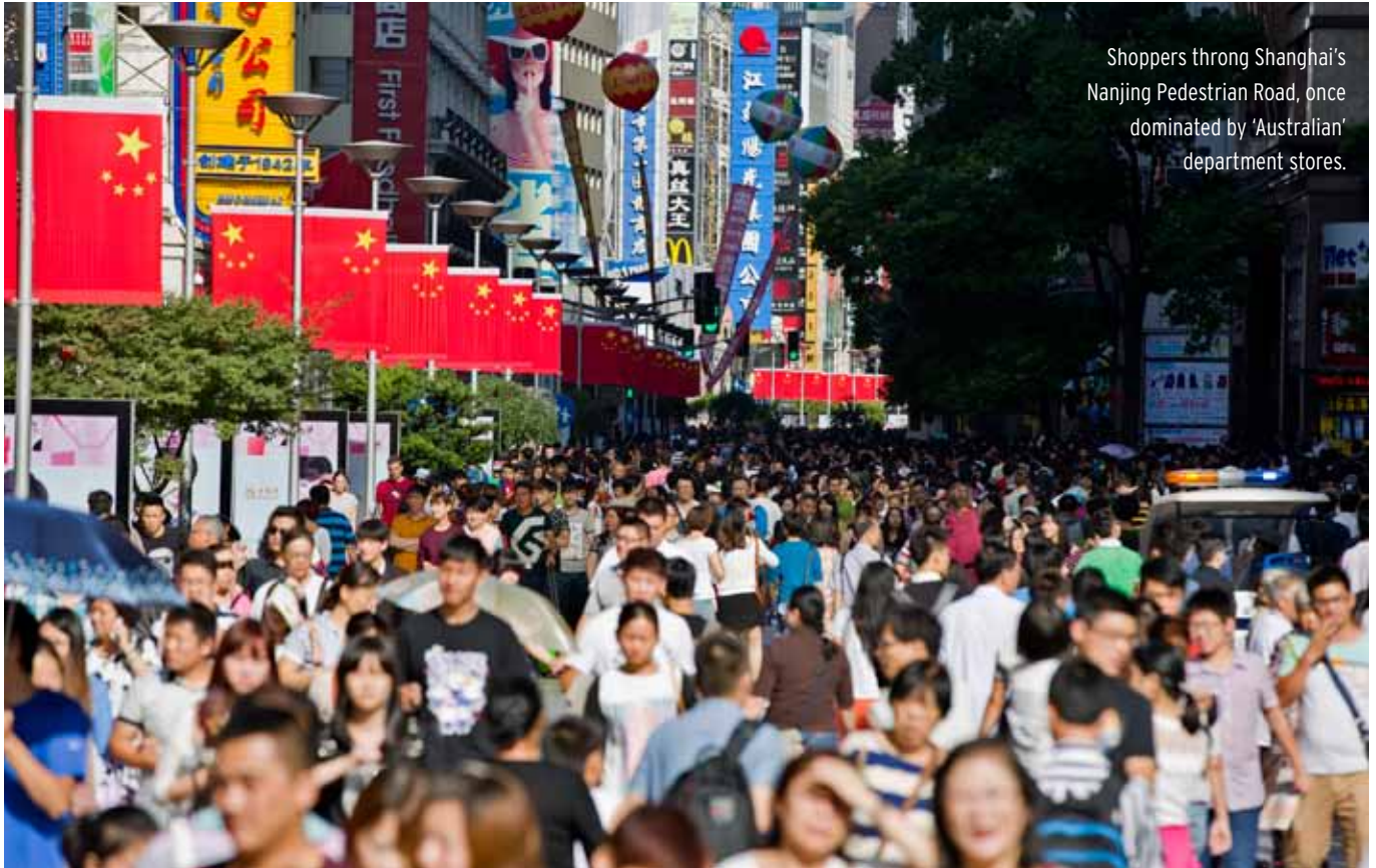
Shoppers throng Shanghai's Nanjing Pedestrian Road, once dominated by 'Australian' department stores.