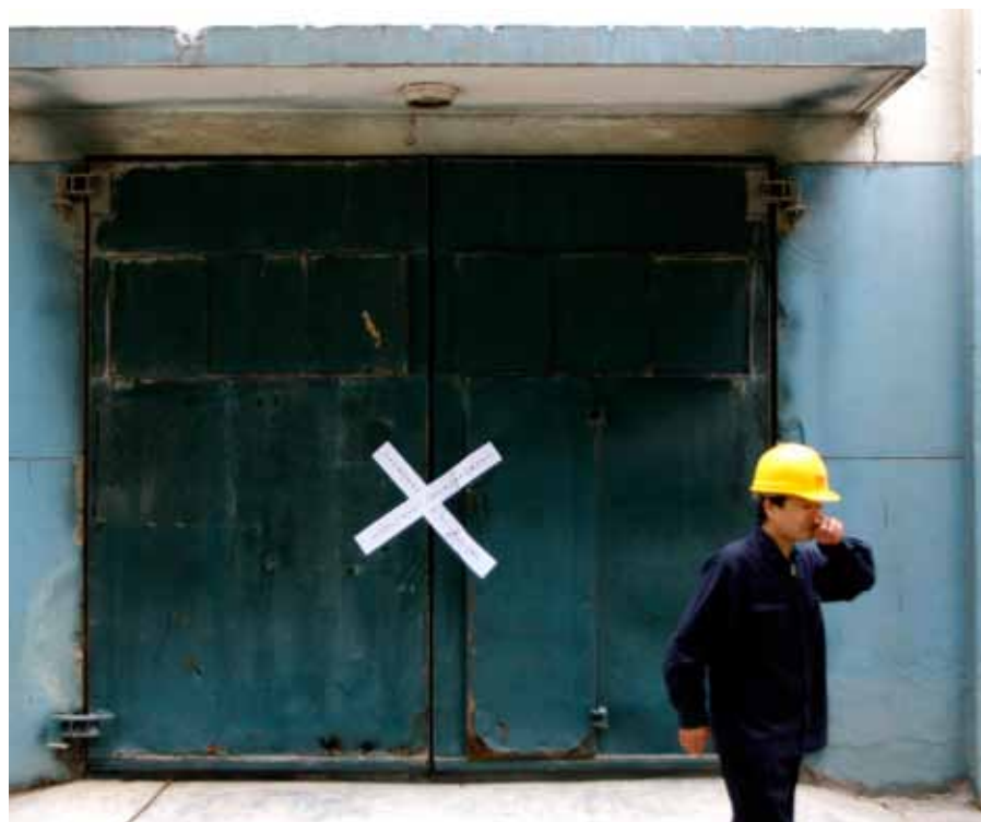
A worker leaves the plant after sealing the doors of a cement factory in northern China. Cement is among the industry sectors with serious overcapacity problems.