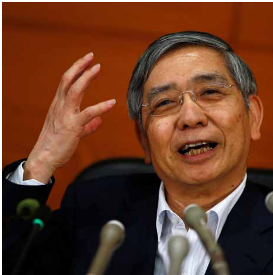
Bank of Japan Governor Haruhiko Kuroda at a news conference in Tokyo in June 2016. He has repeatedly rejected the argument that bank policy is shaped by 'simple monetarist logic'.

There remains a misunderstanding that the BoJ believes the simple monetarist logic that an increase in monetary base automatically raises inflation through broad money creation or inflationary expectations. Kuroda has repeatedly denied that this is so. Rather, QQE was shock therapy, which assumed bold monetary easing might trigger substantial depreciation of the yen. A weaker yen would not only raise inflation, but stimulate