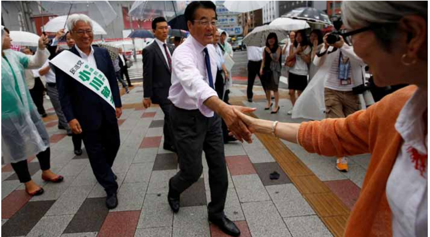
Democratic Party leader Katsuya Okada shakes hands with a voter during a walk-around in Tokyo on the final day of the 2016 upper house election.