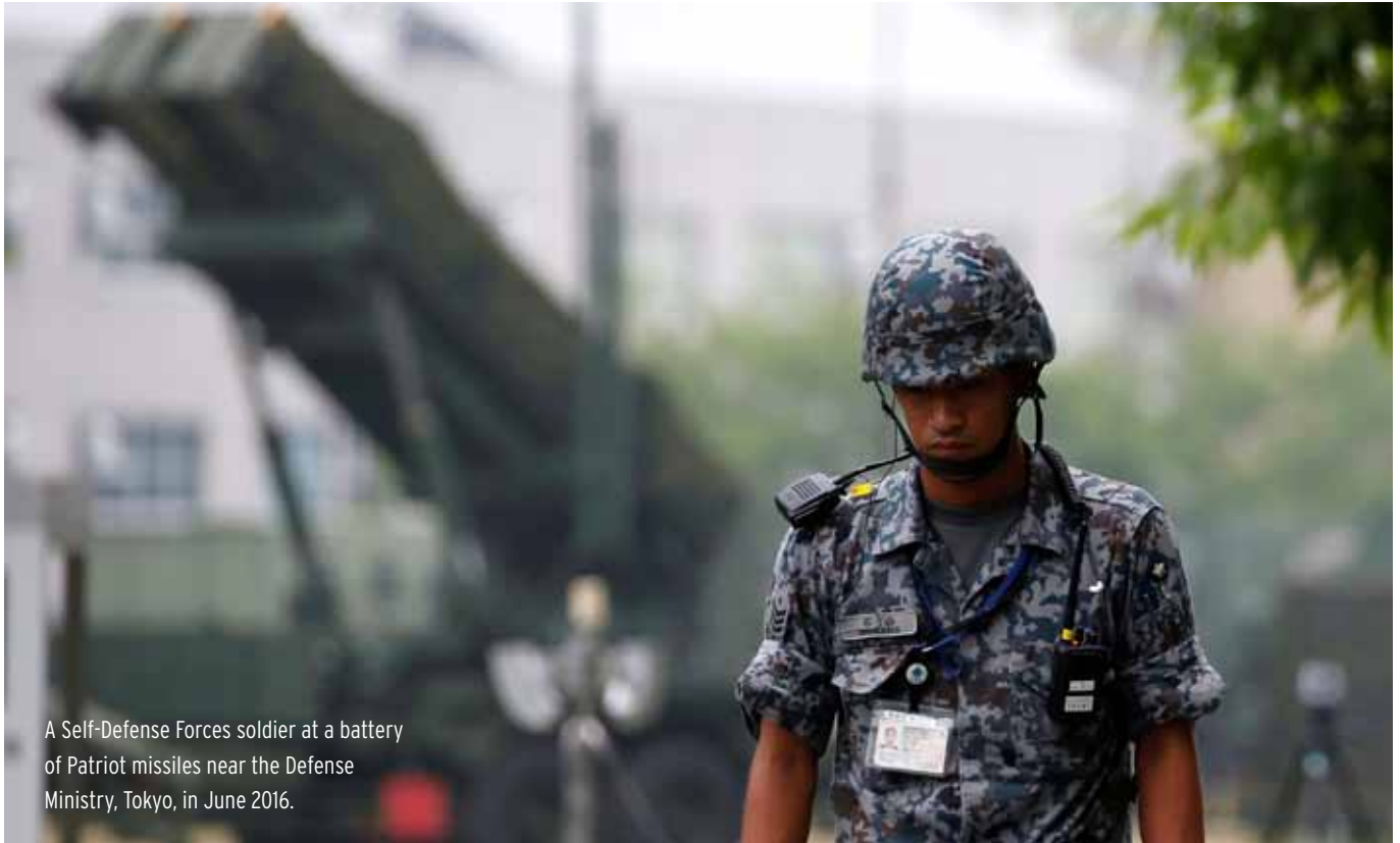
A Self-Defense Forces soldier at a battery of Patriot missiles near the Defense Ministry, Tokyo, in June 2016.