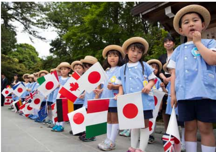
The quality of adult lives that today's children—like these in Ise—are going to enjoy will be determined 'by how Japan's voters weigh their own wellbeing against those who are yet too young to vote'.

In a recent study I built an economic model to study the impact of likely reforms to ensure the social security system is sustainable, in which the government reduces pension benefits by 20 per cent and progressively raises the normal