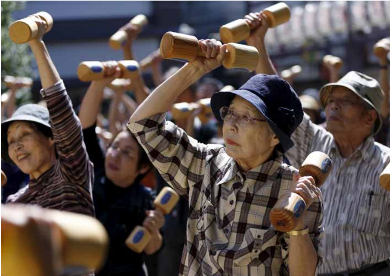
Older people exercise with dumbbells during a health event to mark 'Respect for the Aged Day' at a temple in Tokyo's Sugamo district in September 2015.

retirement age from 65 to 68 over a 30-year period. This would stimulate the economy and bring about a major boost to the government's budget. People would be more motivated to work longer, while saving more, if less was expected to be provided by the government after retirement age.