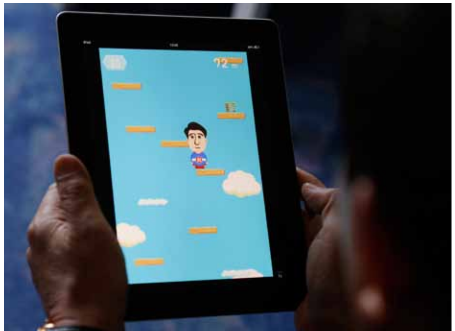
Prime Minister Shinzo Abe as he appears in Abe Pyon, a smartphone app developed by the Liberal Democratic Party to appeal to young voters. Japan needs specific plans to develop young talent.

To be fair, the Japanese labour market has become more flexible over