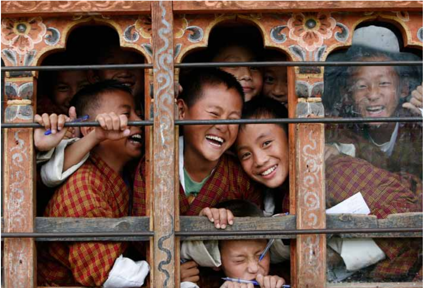
Smiling students look out through their schoolroom window in Thimphu, Bhutan: how do they fit into measures of gross national happiness?