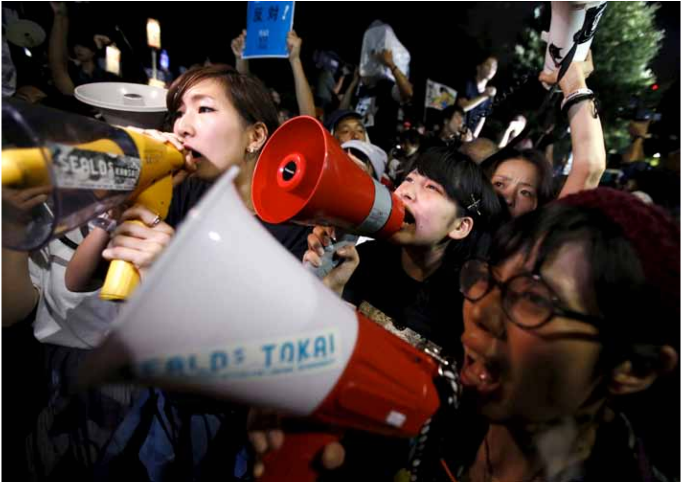
Protesters outside the Diet building in Tokyo on 19 September 2015 voice their objections after Japan's parliament voted to approve controversial security legislation. A majority of Japanese are positive about constitutional revision but oppose changes to Article 9, which renounces the right to initiate war.

revision is not mandatory for these purposes. The pro-revisionists, full of ambition, have a short-sighted view of the impact of changing the wording of the constitution in terms of Japan's security and the higher law.