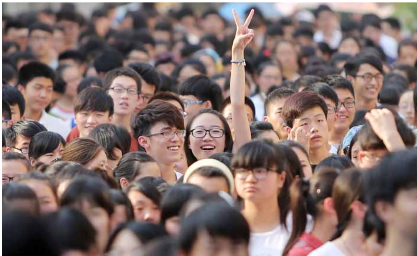
Victory sign: a student signals her satisfaction after taking the national college entrance exams, in Huaibei, China. A growing body of research suggests that mastery and achievement are important for individuals to acquire a sense of wellbeing.

Consider the case of a vegetarian. While becoming a vegetarian is a personal decision, the process of