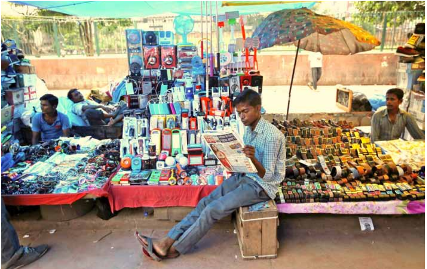
Old media, new media: a roadside vendor in Delhi browses through a newspaper while waiting for customers for his electronic goods.

trade are particularly sensitive to the current stagnation. That includes most of Asia.