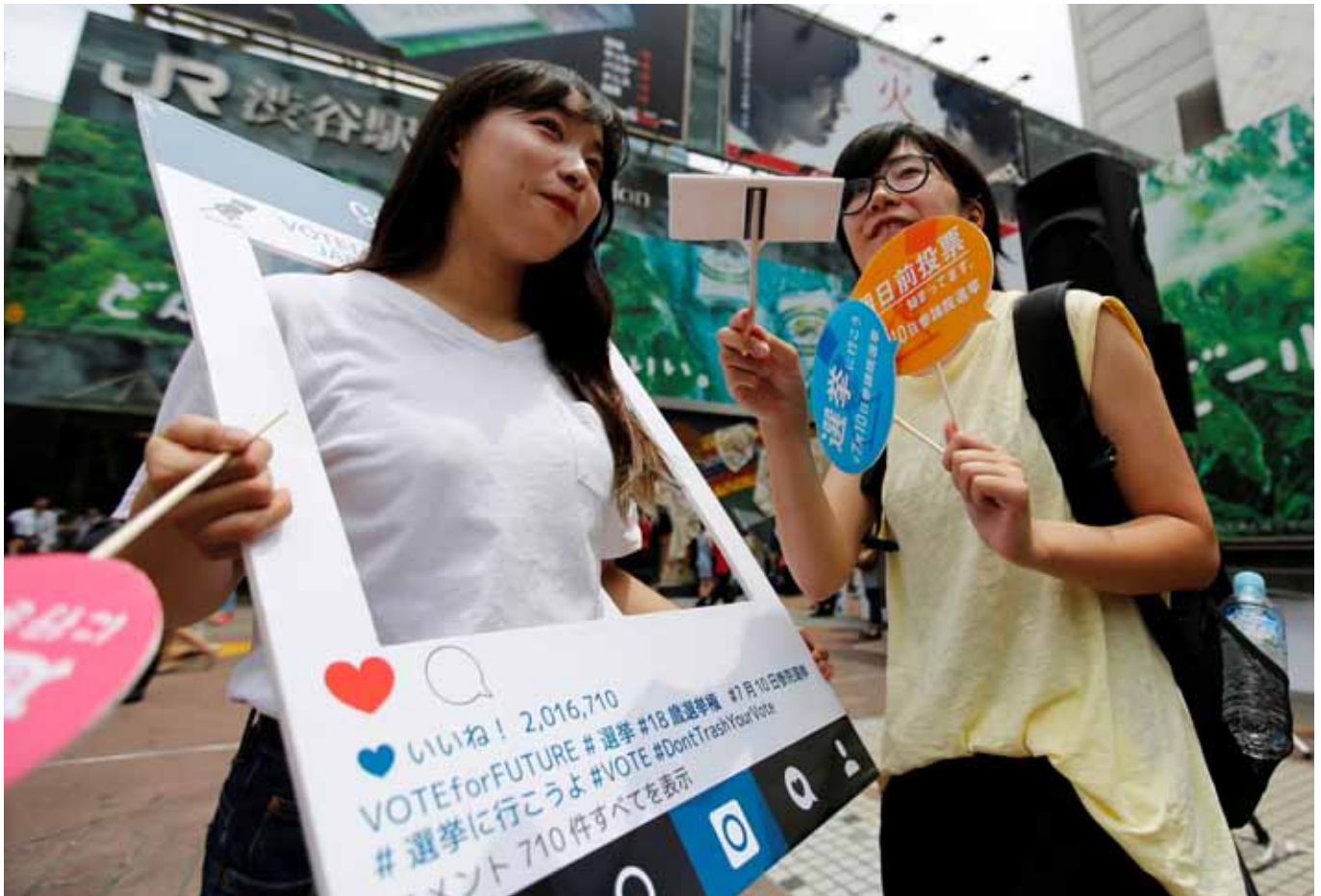
Members of the Students Emergency Action for Liberal Democracy in Tokyo's Shibuya district hold a cardboard Instagram frame and placards urging young people to vote in July 2016's upper house election. Young people are more interested in politics but this is not reflected in participation rates.