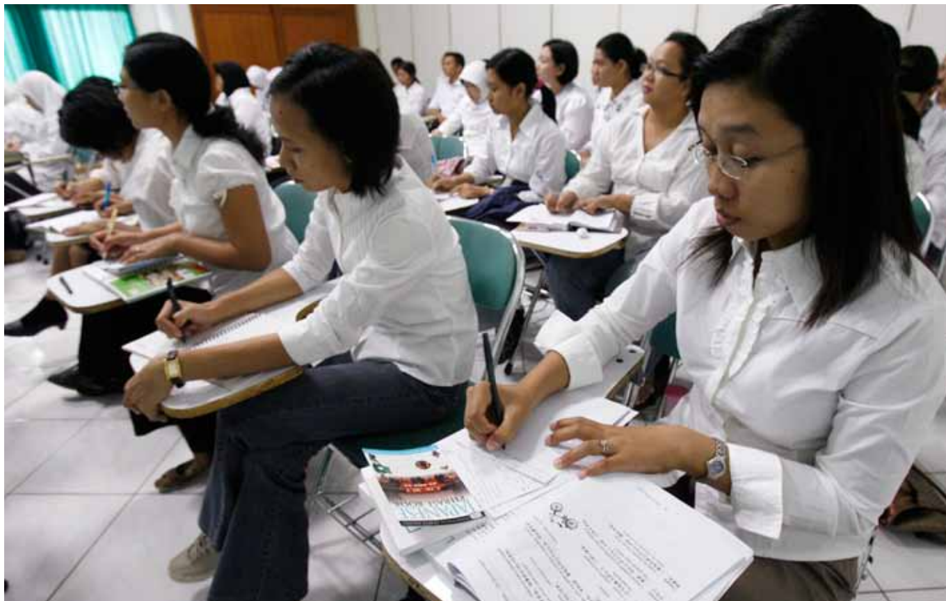
Indonesian nurses study Japanese culture in Jakarta before leaving to work in Japan. Nursing is included in a bilateral economic partnership agreement.

in a recent revision of the refugee recognition system.