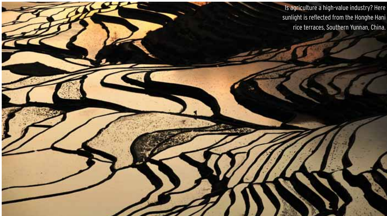
Is agriculture a high-value industry? Here sunlight is reflected from the Honghe Hani rice terraces, Southern Yunnan, China.