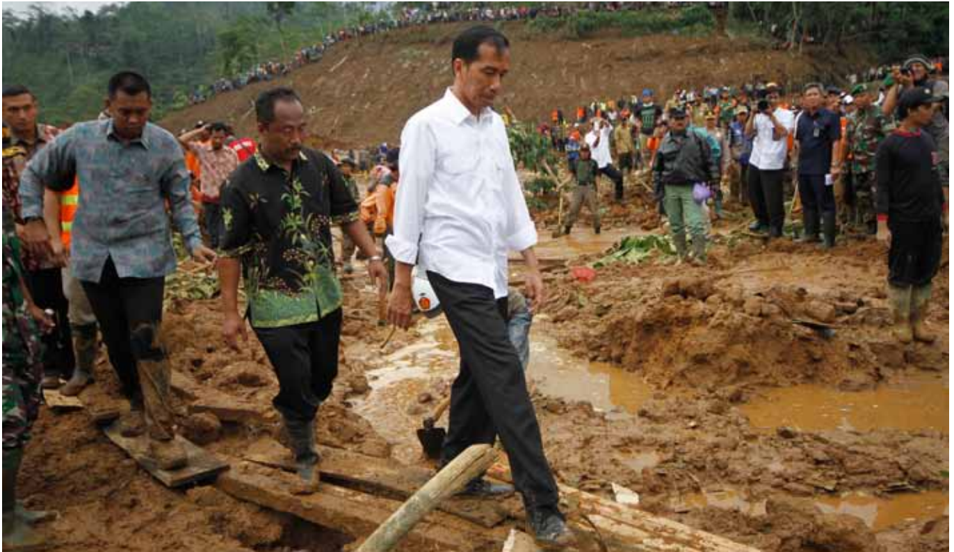
President Joko Widodo inspects the site of a landslide in Jemblung, Java, in December 2014. Underinvestment has contributed to low-quality infrastructure.

During 1966–96, formal sector employment and modern sector wages grew strongly. The Asian financial crisis resulted in a sharp fall in formal employment and real wages. Democratisation unleashed powerful ‘pro-labour’ sentiments. Increased labour market regulation and slower growth resulted in anaemic formal sector employment growth, especially in the manufacturing sector, which had been a key source of dynamic growth. As a result, Indonesia lost competitiveness in international markets for labour-intensive manufactures.