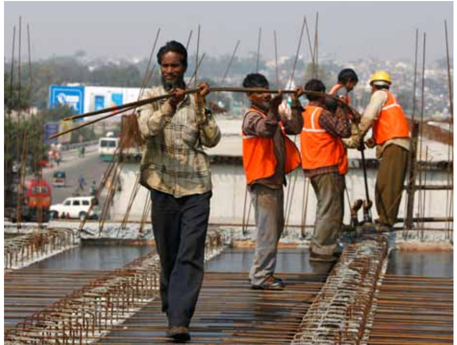
Workers laying reinforcing at a overpass bridge in Jammu in January 2016. Fair land acquisition is a precondition for large-scale investment in growth-supporting public infrastructure in India.

More broadly, the task facing Indian reformers will be made more difficult by three factors that were not faced by other rapid industrialisers in the region. One is the political economy of a large but underdeveloped country. India's democracy is vibrant, but the sheer size of the poor population means that there is a constant temptation for policymakers to focus their attention on spending tax revenues on handouts rather than on stoking economic growth in order