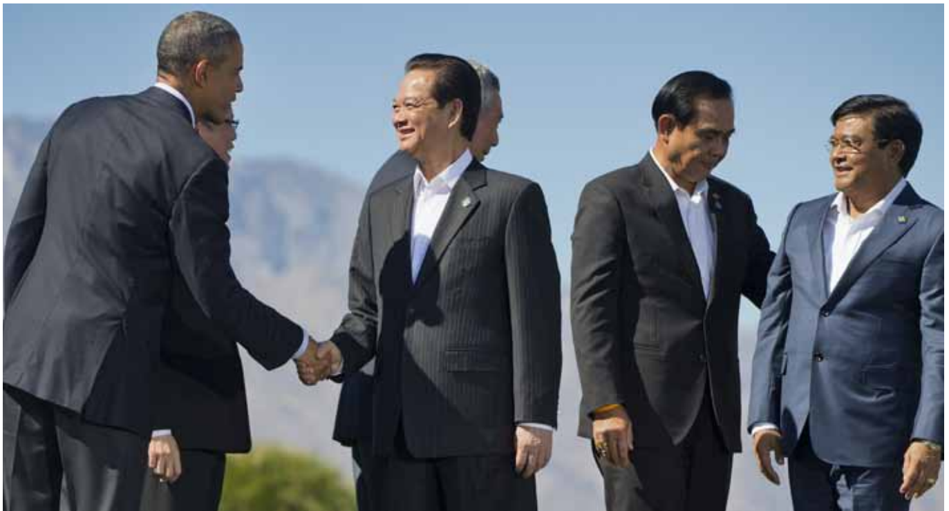
US President Barack Obama greets Vietnamese Prime Minister Nguyen Tan Dung at the meeting with ASEAN leaders at the Annenberg Retreat, Sunnylands, California, in February 2016. ASEAN nations can profit from separate US and Chinese efforts to ‘win friends and influence people’.

With US–China tensions at a medium level, ASEAN countries would profit from the separate efforts of both countries to ‘win friends and influence people’. This is why China bought a possibly overpriced power station from the now-infamous 1Malaysia Development Berhad, why President Obama played golf with Malaysian Prime Minister Najib as a show of political support, why China made a more generous offer than Japan to build the high speed railway connecting Bandung and Jakarta, and why the US granted extraordinary exemptions to Vietnam