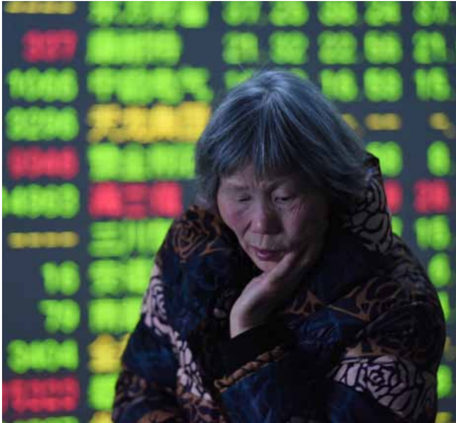
Green signals falling prices and rising concerns for this investor in Hangzhou, China, in February 2016. Despite ups and downs, well-developed financial markets allocate capital efficiently.

global technology frontier, the ability to upgrade, catch up and innovate is important to their closing that distance. To reach the frontier, countries need to be open to ideas and have institutions that allow for more complex interactions across the economy. That would seem to include good governance characterised by decentralised economic decision-making.