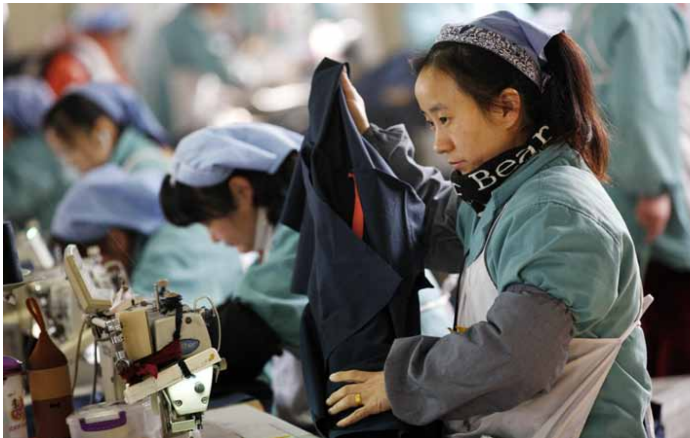
Workers making clothes for export at a factory in Huaibei city, China: countries that have joined global value chains have seen productivity rise.