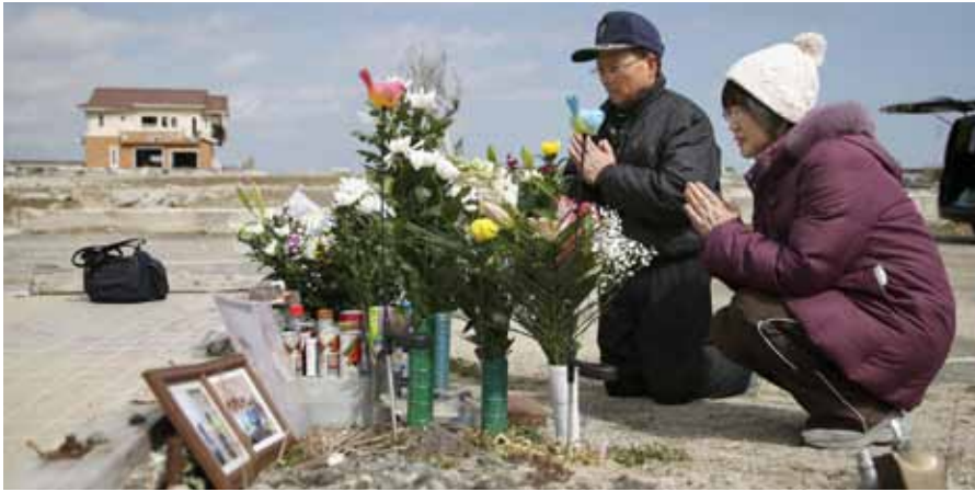
A couple offer prayers for the dead at a commemoration in Namie, Fukushima province.