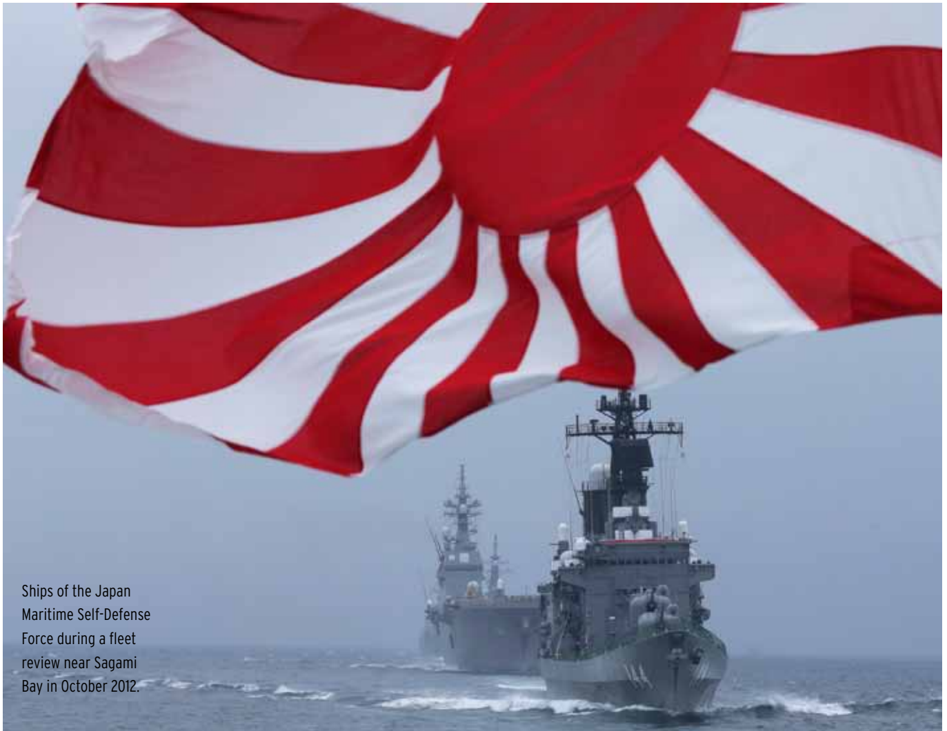
Ships of the Japan Maritime Self-Defense Force during a fleet review near Sagami Bay in October 2012.