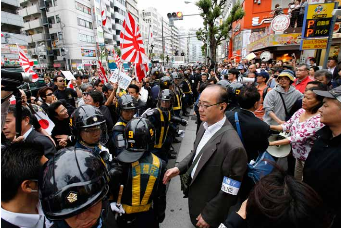
Riot police keep a cordon around nationalist demonstrators taking part in an anti-Korean march through a street in Tokyo's Shin-Okubo district in May 2013. Prime Minister Abe's efforts to break through Japan's military 'allergy' and change the country's security policy has had unwanted side effects and helped to push relations with China and South Korea to their lowest point in decades.

through which the public in each country perceives the bilateral relationship must be broadened to emphasise areas of cooperation rather than the relentless focus on the territorial disputes and history issues that dominate mainstream media. The Senkaku/Diaoyu islands issue presents a particularly dangerous scenario and greater efforts from both countries are needed to reduce tensions and avoid an accident that could spark conflict. Establishing a military-military hotline to deal with emergencies would be a good first step.