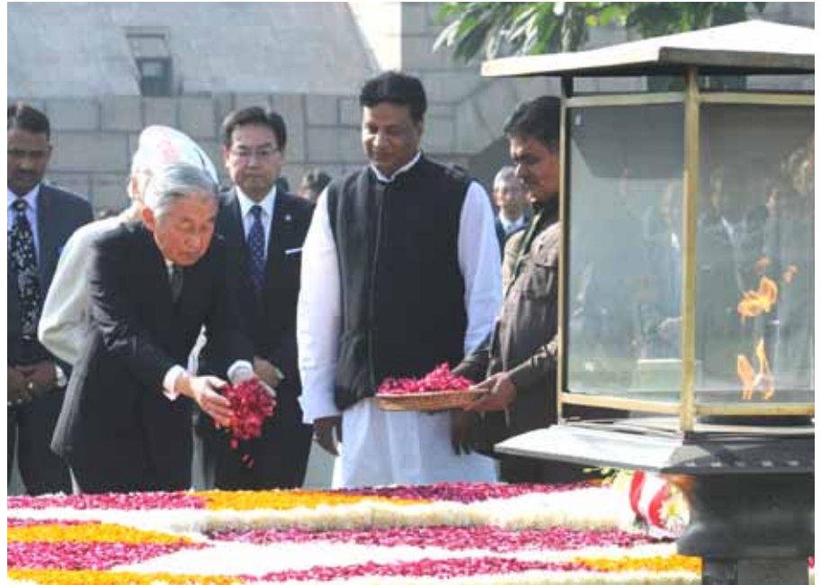
Emperor Akihito pays a floral tribute to India's great independence leader during his visit to the Samadhi of Mahatma Gandhi at Rajghat, Delhi, which was part of the royal tour in December 2013. The visit by the emperor and empress added impetus to Japan's intention to pursue closer relations with India.

The policy principles that are laid out in the NSS, while effective, are designed for Japan's peacetime activities. How Japan can expand its participation in activities in times of crisis or post-conflict—whether as a part of peacekeeping forces that are organised under the UN or