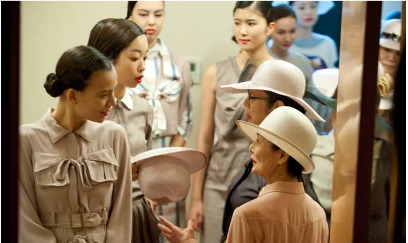
Generations united by fashion: models young and old wait to strut the catwalk at a grandmother and granddaughter show in Tokyo in 2014. Despite all the perceived problems, dealing with the challenge of ageing can also be a source of innovation.

population is a negative factor for economic growth, its impact is not quantitatively decisive because growth in an advanced economy is mainly growth of income per person.