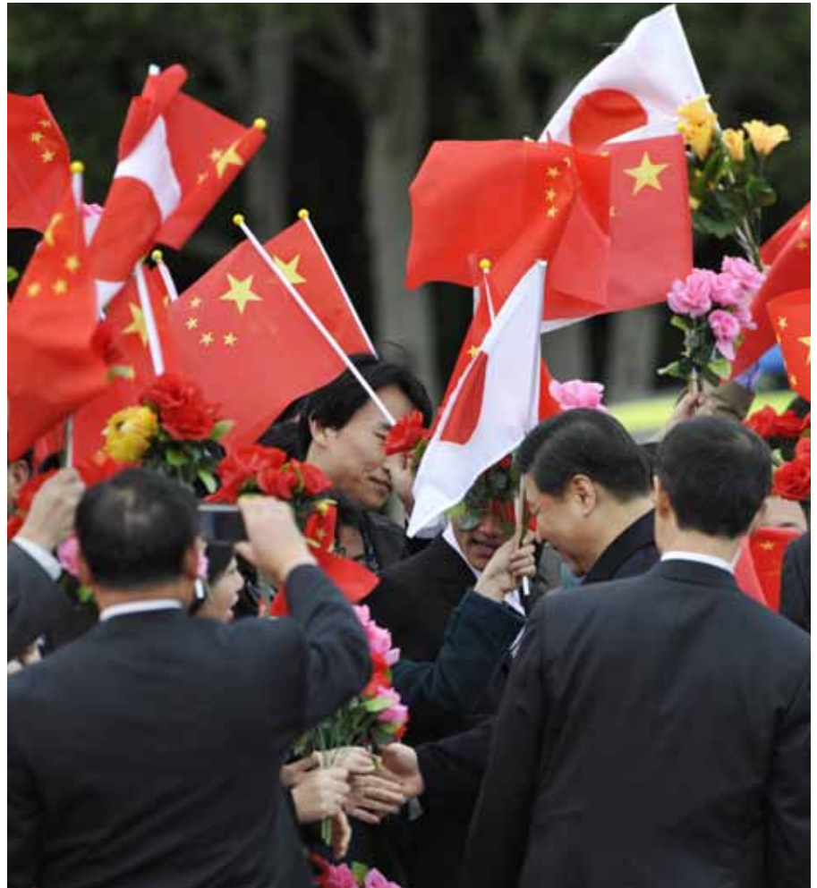
Wellwishers greet Xi Jinping, then China's vice-president, at Haneda airport in December 2009. As president, Xi has the responsibility for promoting peace, tolerance and international trust, and at the same time building 'powerful armies' and a 'strong maritime nation'.

became the second-largest economic power in the world, and over this time the country has also rapidly strengthened its military muscle. Following the increase of economic and military power and the heightened self-awareness as a superpower, political leaders, think-tanks, scholars and young people have started to