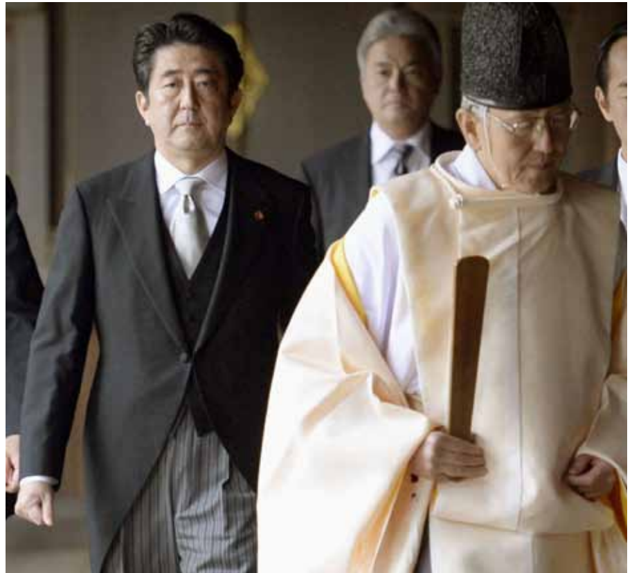
Prime Minister Abe paying an official visit to Yasukuni Shrine in December 2013, the first such visit by a Japanese prime minister in seven years.

The third area is the loosening of restrictions so that SDF personnel participating in UN peacekeeping operations will be able to use weapons in line with UN rules of engagement. The final area is allowing the SDF to come to the aid of a 'foreign country in a close relationship with Japan' if three conditions are satisfied: the attack threatens the Japanese people's constitutional right to 'life, liberty