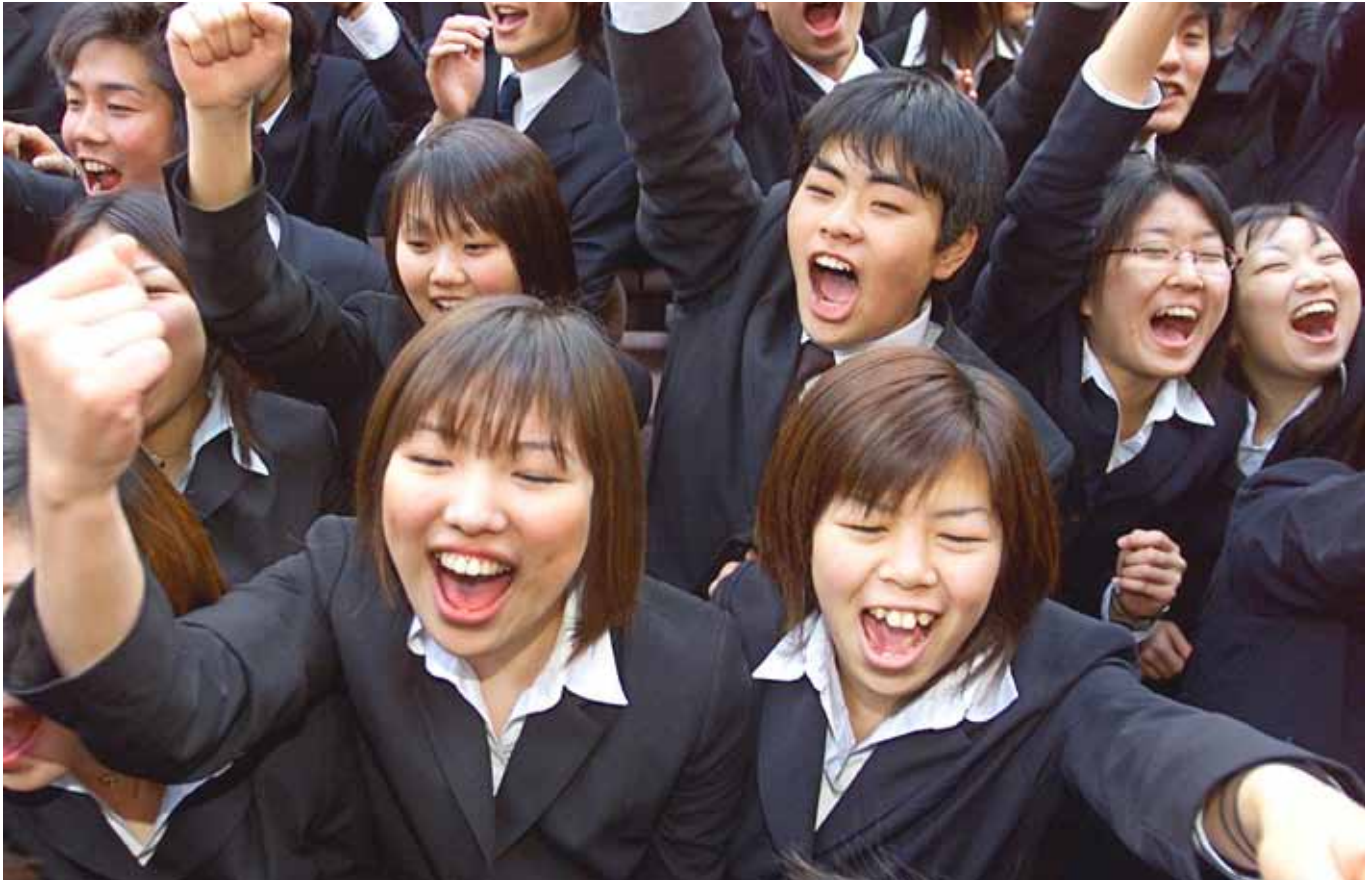
Graduates ready to plunge into the world of work. Labour market reform is critical to letting young women fully use their abilities.

Japan is that it is necessary to stay in a particular firm for a long time to secure a promotion. The average length of female employment is shorter than that of their male counterparts, due mainly to women's disproportional responsibility in the home. Thus if promotions were not based on seniority alone the gender disparity among managers would be smaller.