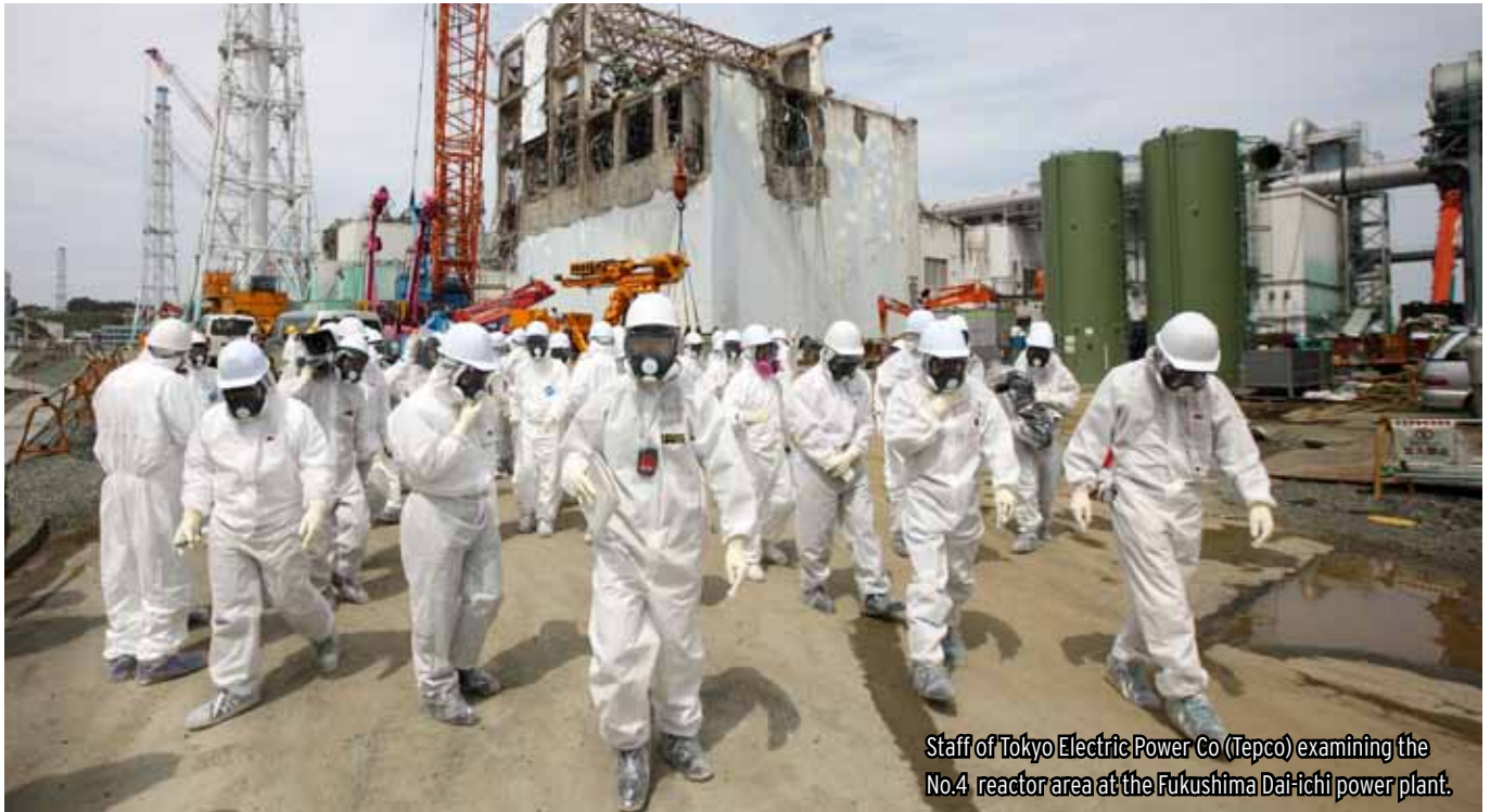
Staff of Tokyo Electric Power Co (Tepco) examining the No.4 reactor area at the Fukushima Dai-ichi power plant.