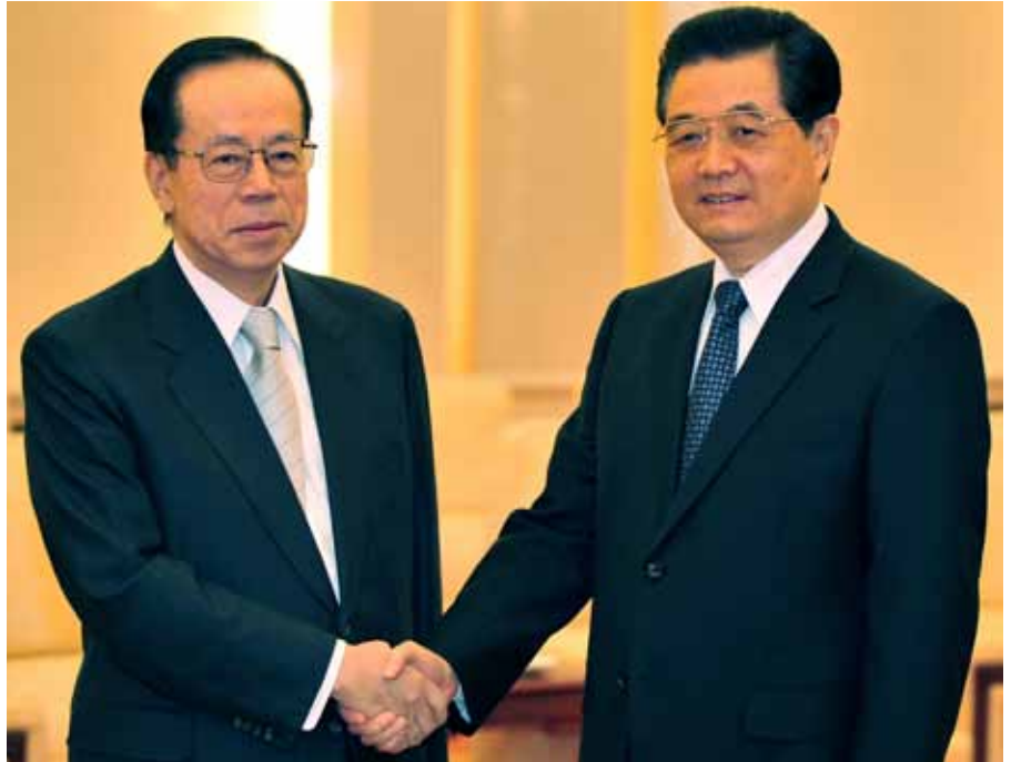
Yasuo Fukuda and Hu Jintao, authors of the far-sighted Principled Consensus between China and Japan.

A private Chinese trawler was caught fishing in the territorial waters of the disputed Senkaku/Diaoyu islands and recklessly rammed two Japanese coast guard vessels as they tried to enforce Tokyo's writ in these waters. Beijing's cautious willingness to jointly manage the political fallout from the incident turned to anger when the government under