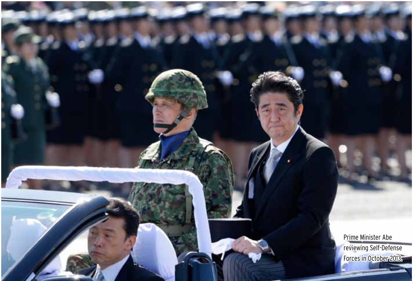
Prime Minister Abe reviewing Self-Defense Forces in October 2013.