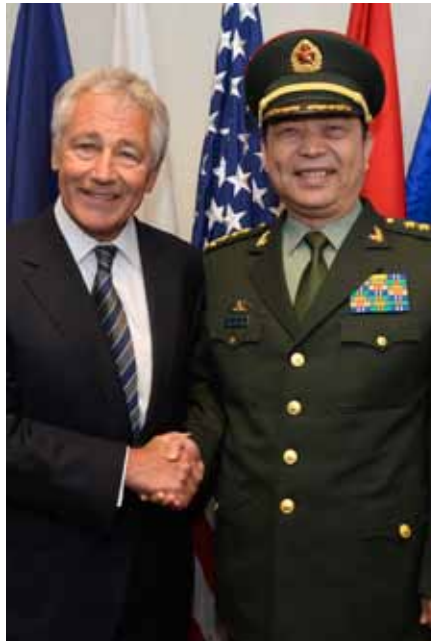
US Defense Secretary Chuck Hagel and China's Minister of National Defence, General Chang Wanquan, at the Pentagon in August 2013.

On the other side of China, the United States will be able to move resources from Central Asia and