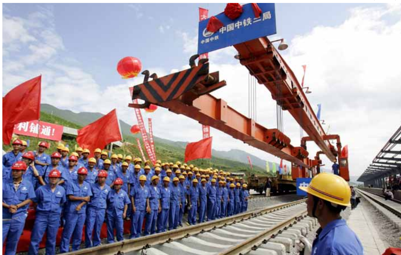
A rail-laying ceremony at a construction site in Yunnan province: as logistics improve, gaps between China's regions will diminish.

(and reiterated in the 12th Program): the idea that western China should be opened up further to China's west, across land borders to its Asian neighbours. This 'bridgehead' concept—which has been developed most fully in Yunnan—creates the space for new drivers of development in western border provinces, on the back of both transborder infrastructure development and rapid growth in trade and investment between China and many of the developing economies in Central, South or Southeast Asia. The recent agreement in principle between China and Pakistan to build an economic corridor linking the two countries is an example of the sort of development this might lead to.