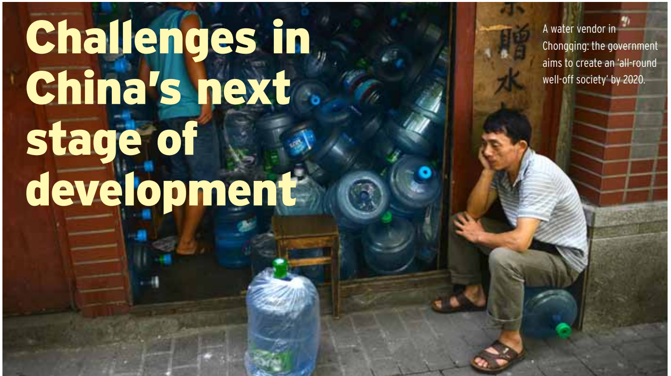
A water vendor in Chongqing: the government aims to create an 'all-round well-off society' by 2020.