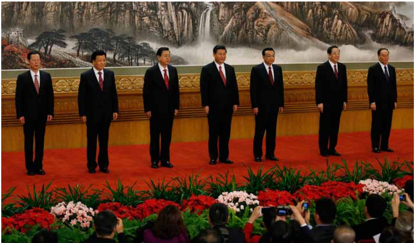
China’s inner circle: the new Politburo Standing Committee—Zhang Gaoli, Liu Yunshan, Zhang Dejiang, Xi Jinping, Li Keqiang, Yu Zhengsheng and Wang Qishan—are presented in the Great Hall of the People in Beijing on 15 November, 2012, the day after the 18th Chinese Communist Party Congress ended.

Whatever differences there may be within the leadership, one thing on which they all agree is that in the party state (党国)—that is, the People’s Republic of China (PRC)—it’s the party that comes first. Whether a leader is a ‘princeling’, a China Youth League man, a protégé of Jiang Zemin or of Hu Jintao, there is the same sense of entitlement and ownership—China is us. This is very much the case with Xi Jinping, already showing signs of being more than primus inter pares (unlike Hu Jintao). He presents as strong, confident and clear (although