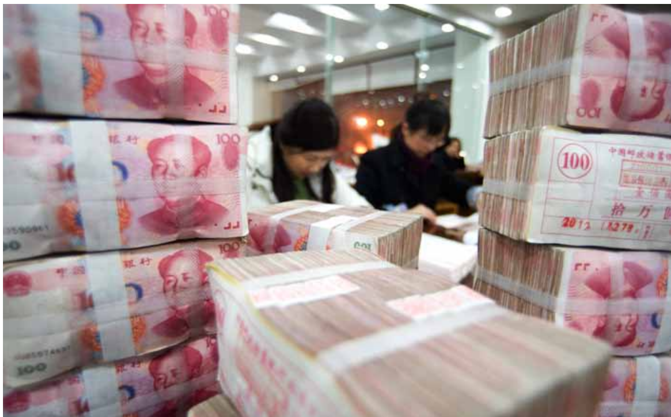
Piles of money: clerks count the holdings at an agency in Nantong. Premier Li Keqiang Li has stated that banks must make better use of existing credit and step up efforts to contain financial risks.

and some of the smaller and weaker financial institutions may fail in the coming year.