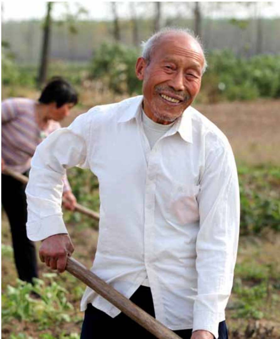
An elderly man tills the soil near Bozhou. Many younger people have left rural areas to make a living in the cities. Mandatory retirement ages are low by international standards.