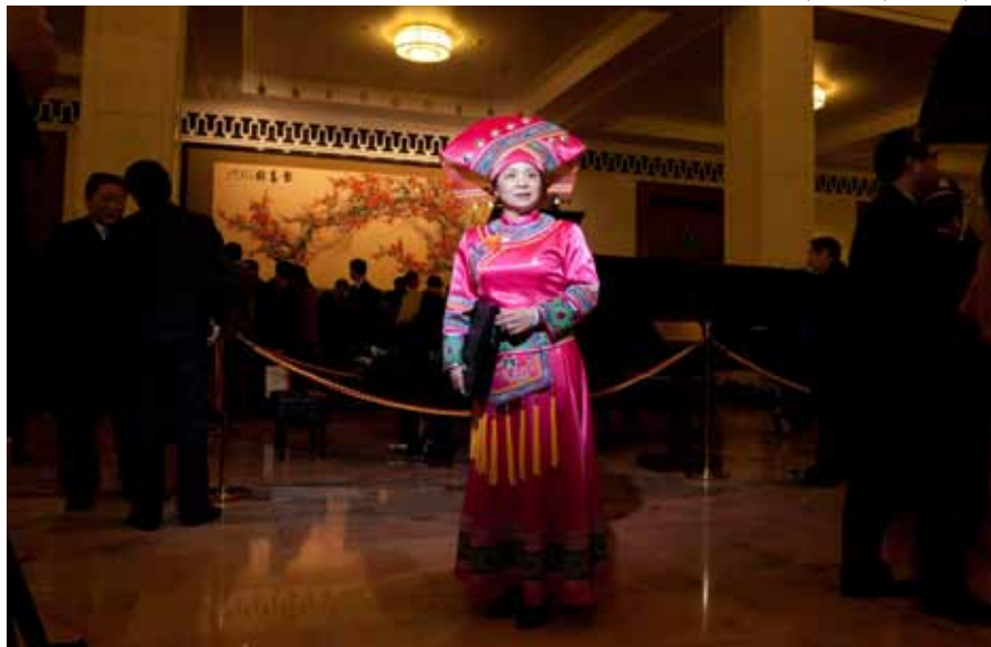
An ethnic-minority delegate arrives at the Great Hall of the People for the National People's Congress in March 2012. Officials who run the 33 provinces are an important potential constituency in China.

granted special treatment, they clamoured to get some of these lucrative market opportunities for themselves. Over time this strategy of playing to the provinces built a bandwagon of support from provincial and local officials for the market reforms, which subsequently overwhelmed the vested interests in the command economy that were once so strong in the central planning bureaucracy and the heavy industrial ministries.