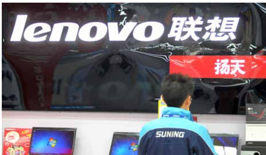
Plugging into the world: Lenovo's several foreign acquisitions include IBM's personal computer business.