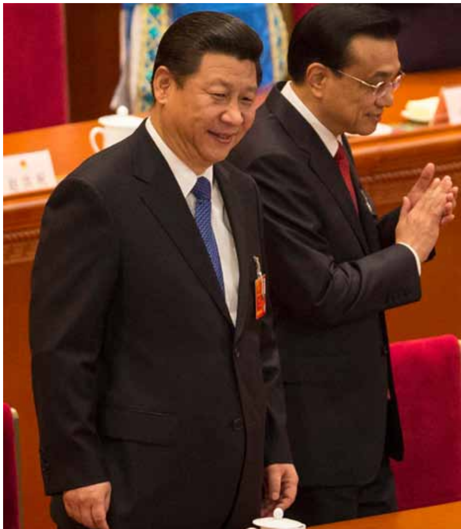
President Xi Jinping and Premier Li Keqiang at the National People's Congress in March 2013. The leaders share a commitment to pursue economic reform.

this worrying. Equally of interest is that despite a recent spate of arrests, there has been pushback. A well-connected figure speaking to a group of veterans and their descendants earlier this year specifically attacked the 'two negatives', and also strongly criticised another statement known to have been made by Xi concerning the collapse of the Soviet Union. Similarly, when in August 2013 the overseas edition of People's Daily published an editorial attacking calls for constitutionalism as part of a Western conspiracy, almost simultaneously the Central Party School's Study Times