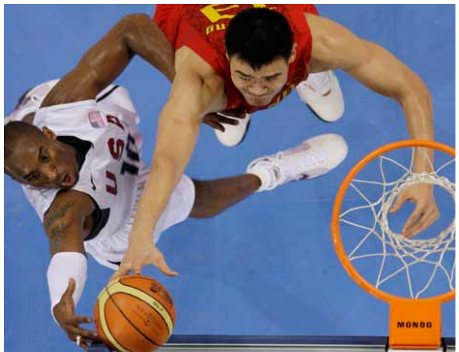
Kobe Bryant of the USA and China's Yao Ming battle for a rebound at the 2008 Olympics in Beijing. If the USA had been containing China, Yao might not have played for the Houston Rockets.

This raises the all-important question of what kind of country China will become. It should be