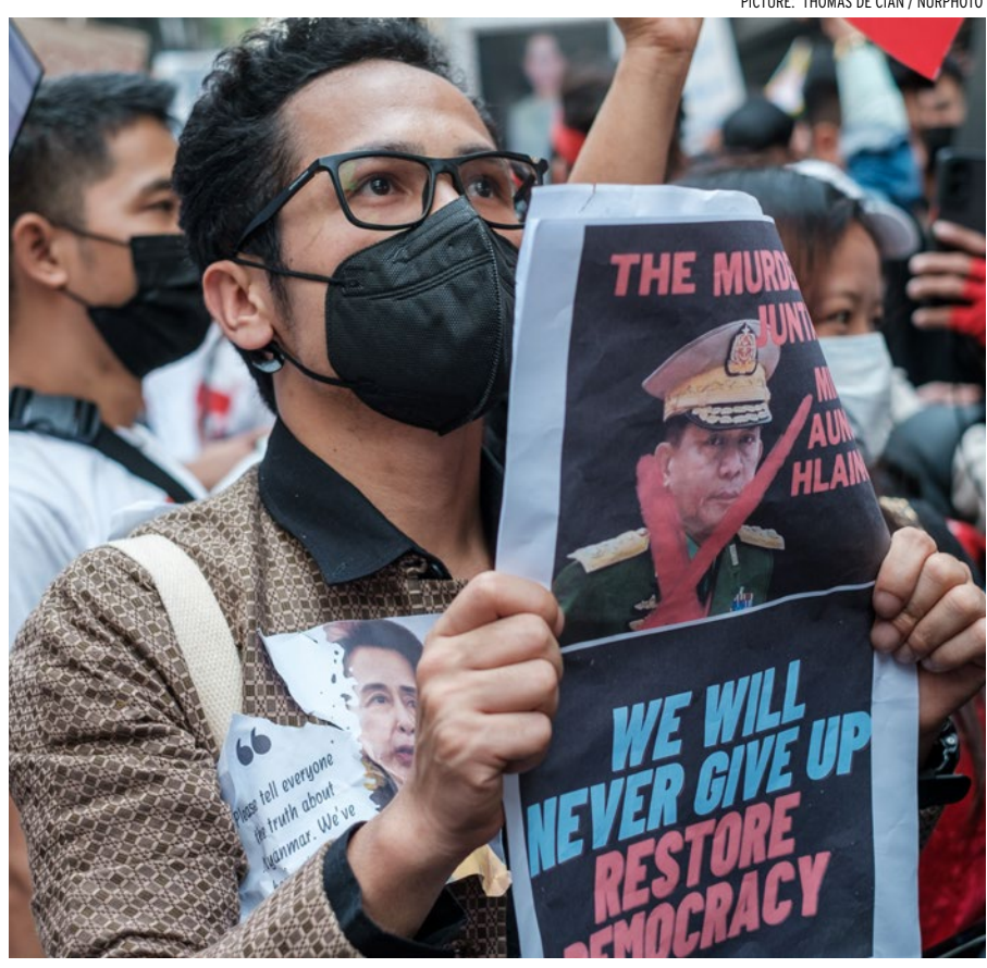
A protester holds up a pro-democracy sign at a protest at the Myanmar Embassy in Bangkok (2023).