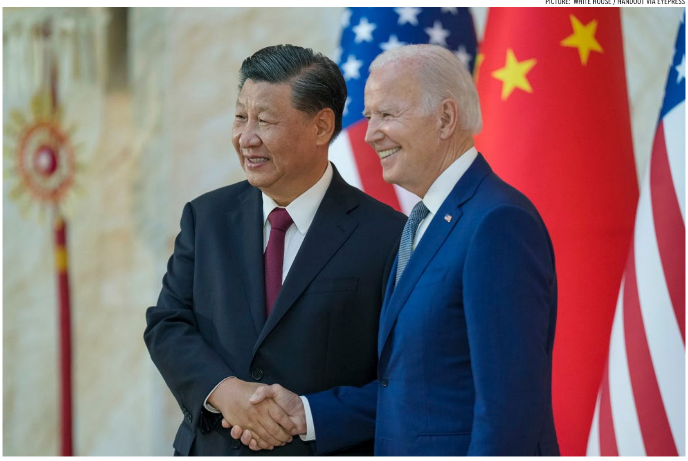
US President Joe Biden shakes hands with Chinese President Xi Jinping on the sidelines of the G20 leaders' summit in Bali (2022).

composition of US–China bilateral trade has also shifted away from goods with the highest tariffs.