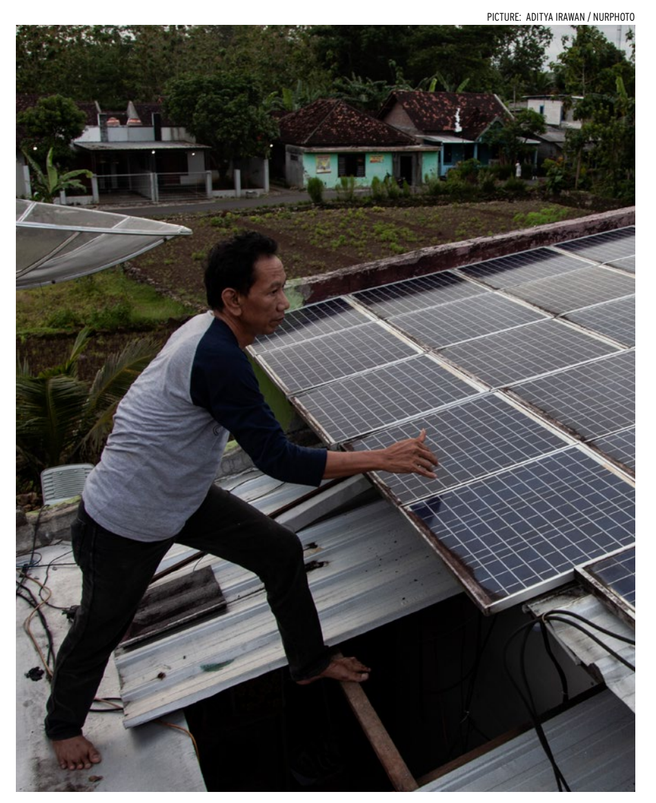
A campaigner for energy transformation in Indonesia is pictured with the solar panels installed at his home in Special Region of Yogyakarata (2022).

But Indonesia needs to exercise caution when it comes to disbursing windfall revenues even though it may provide a short-term boost to the economy. The new revenue stream may not be sustainable in the long