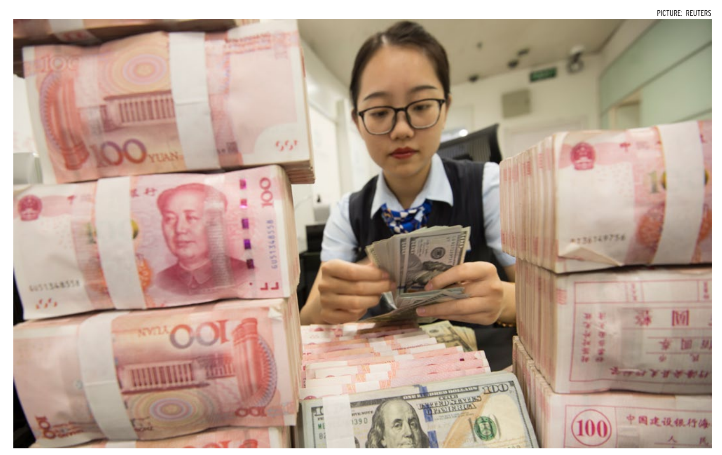
A Chinese clerk counts US dollar notes over RMB yuan notes at a bank in Hai'an city (2019).

A popular narrative tells us that as China is now the world's second-largest economy, the largest trading nation and the largest trade partner to 120 countries, it is inevitable that the RMB will play a larger role in the international economy