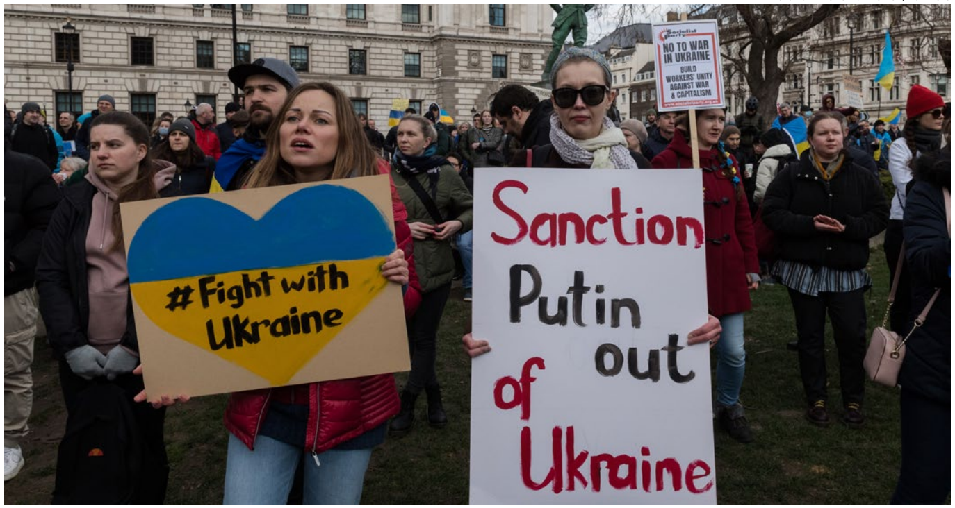
Protestors in London demand the supply of air defence and anti-missile systems, implementation of further sanctions including bans on energy trade, exclusion of all Russian banks from the SWIFT payment network and help for refugees on the 11th day of Russian invasion of Ukraine (March 2022).

freezing Russian assets—such as the foreign exchange reserves held by the Russian Central Bank in foreign central banks—and the expulsion of Russian banks from the SWIFT interbank network. Major restrictions on goods and services trade were also imposed.