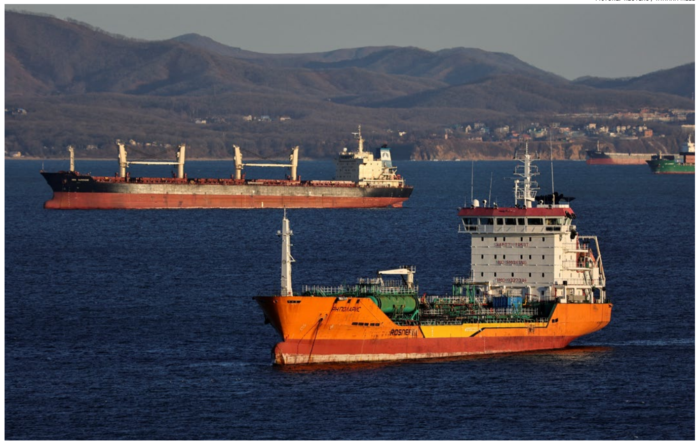
Oil tankers and shipping vessels sail near the port city of Nakhodka, Russia (December, 2022).