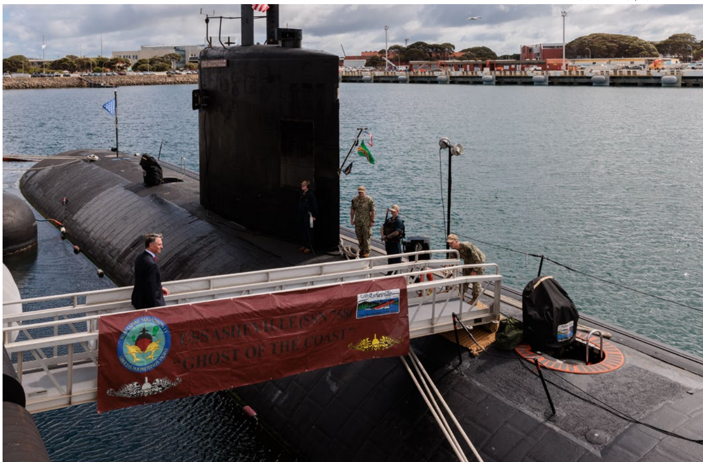
Australian Minister for Defence Richard Marles boards the USS Asheville, a Los Angeles-class nuclear powered fast attack submarine (Perth, 2023).