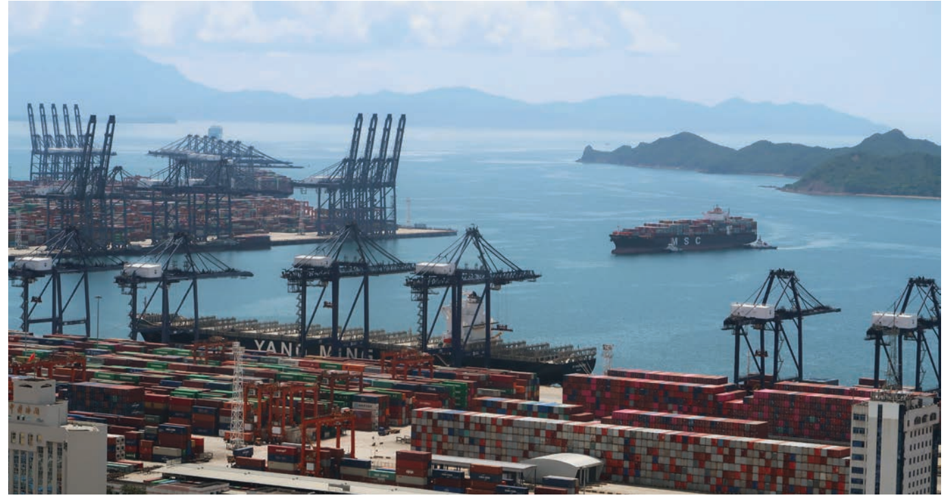
A cargo ship carries containers near the Yantian container terminal in Shenzhen, Guangdong province, May 2020.