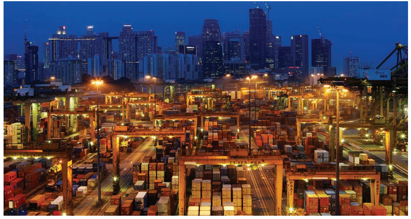
Operations at the PSA International port terminal in Singapore. Connected to more than 600 ports in some 120 countries, Singapore is one of the world's busiest shipping hubs and is often called the gateway to Asia.

continued to function and even had a record number of STCs submitted through a newly established written procedure. Its success should be studied and, if possible, replicated in other committee work throughout the organisation.