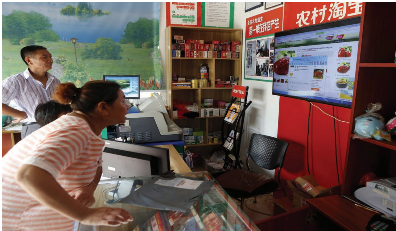
A customer shops at an Alibaba rural service centre in Jinjia Village, Zhejiang province, China, 2015.

digital platforms found that business to consumer (B2C) digital platforms (including e-commerce, online travel, advertising technology, transportation, e-services and digital media) generated US$3.8 trillion in revenue in 2019. with US$1.8 trillion of it in Asia. E-commerce alone accounted for US$1.9 trillion in revenue globally and US$1.1 trillion in the region. China has become a leader in this area, now accounting for 45 per cent of e-commerce transactions. Online sales already represent 12 per cent of total retail sales in Asia, compared with 8 per cent in Europe and North America. The digital economy is expected to add US$1 trillion to Asia's GDP in the next 10 years.