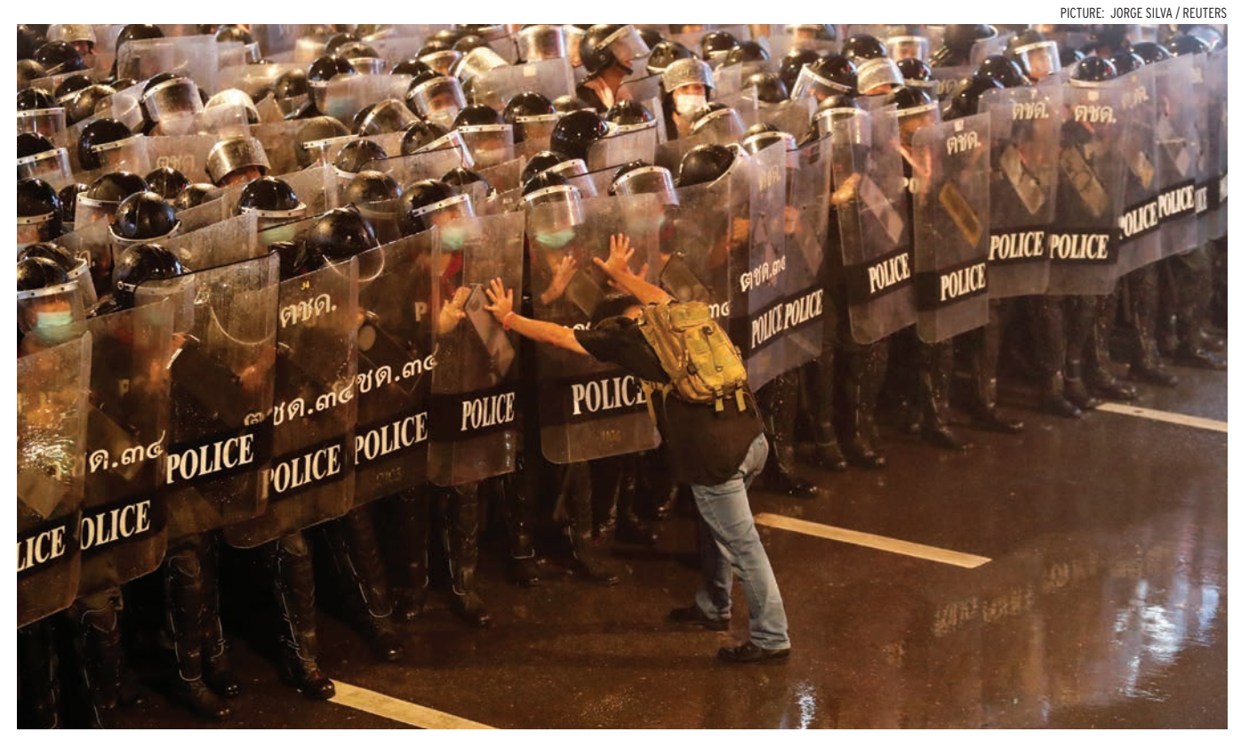
A man pushes against police officers during an anti-government protest in Bangkok, October 2020.