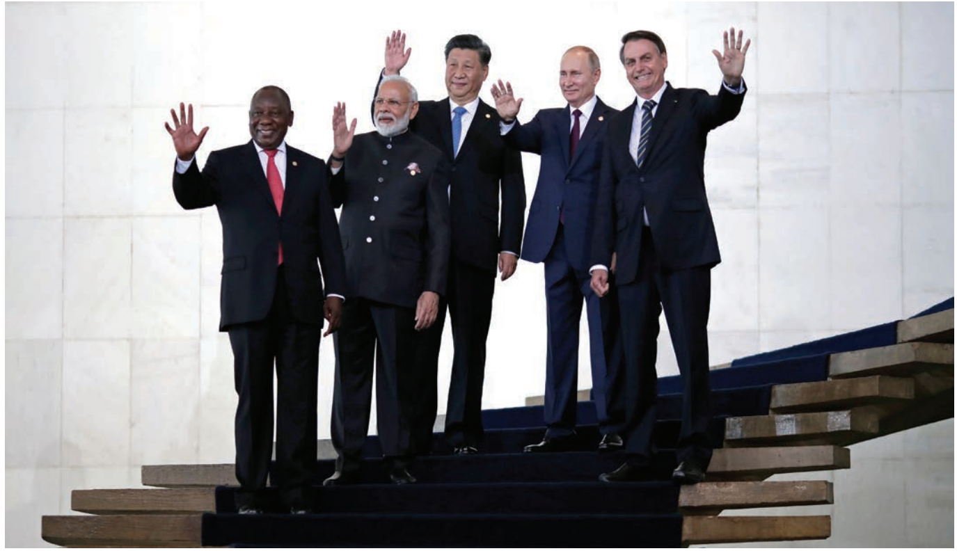
Presidents of Brazil, Jair Bolsonaro, Russia, Vladimir Putin, China, Xi Jinping, South Africa, Cyril Ramaphosa and India's Prime Minister Narendra Modi pose for the cameras as they arrive for the BRICS summit in Brasilia. November 2019.