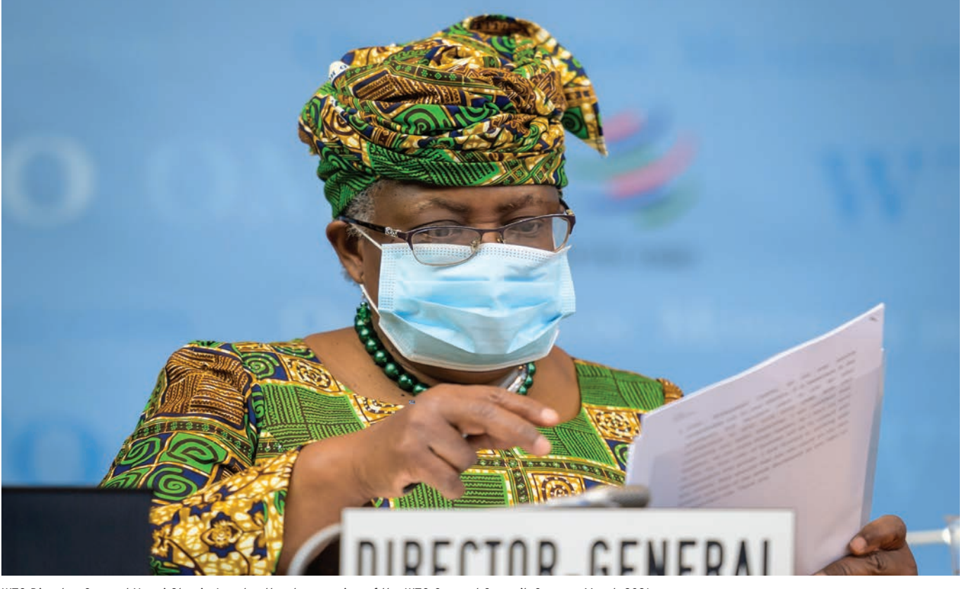
WTO Director-General Ngozi Okonjo-Iweala attends a session of the WTO General Council, Geneva, March 2021.