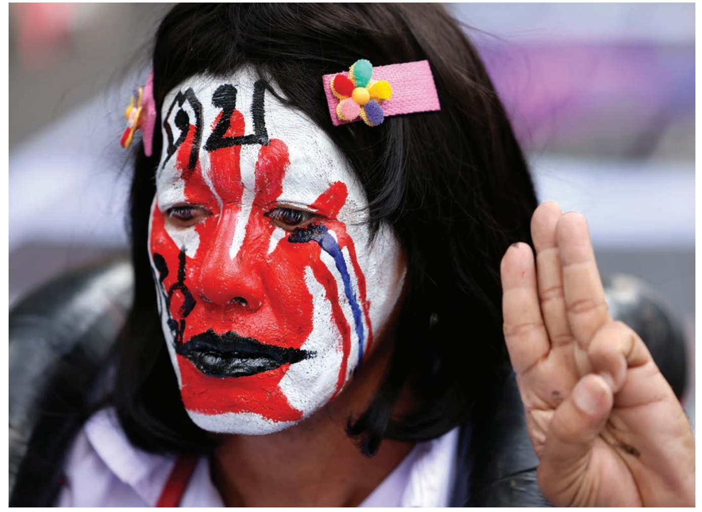
A protester shows the three-finger salute while taking part in a protest against the government and to reform the Thai monarchy, Bangkok, October 2020.

fandoms, YouTube and internet idols, LGBTQI+ communities, and netizens on emerging social media platforms, the pro-democracy movement has expanded considerably.