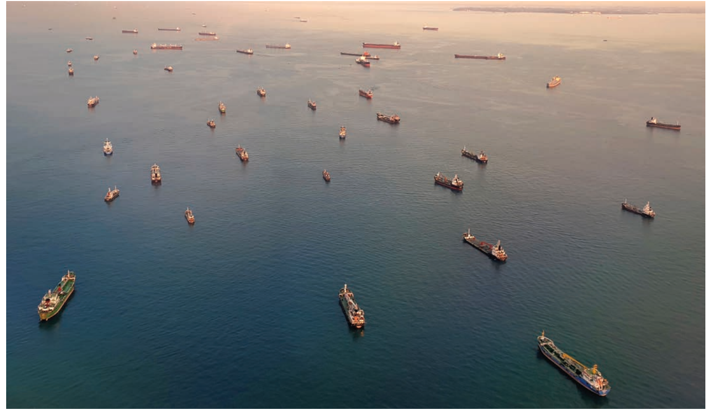
Vessels anchored in the Singapore Strait wait for access to one of the world's busiest ports, April 2019.