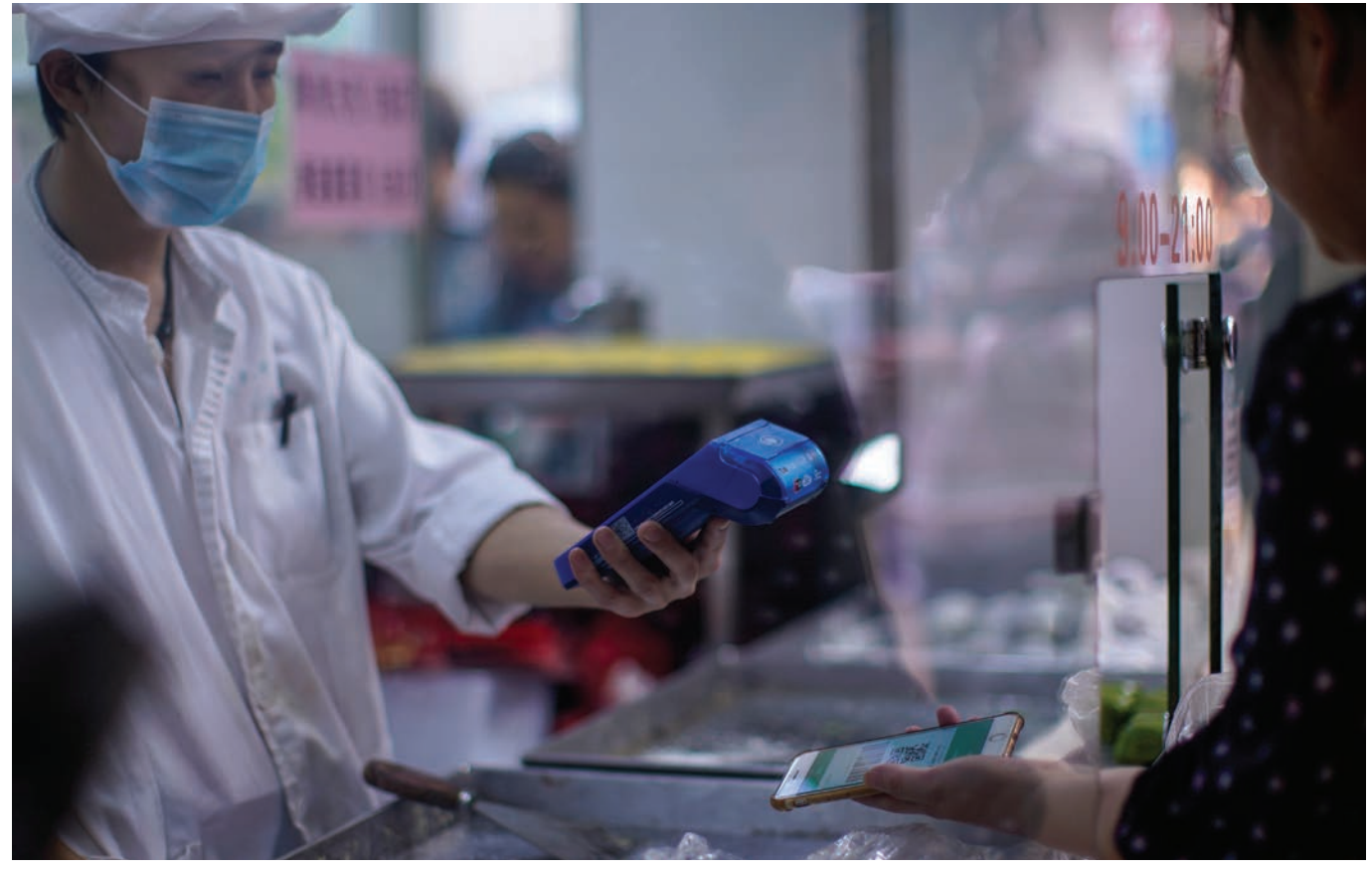
Digital payment technologies such as QR codes have enabled contactless trade during the COVID-19 pandemic, Shangai 2020.