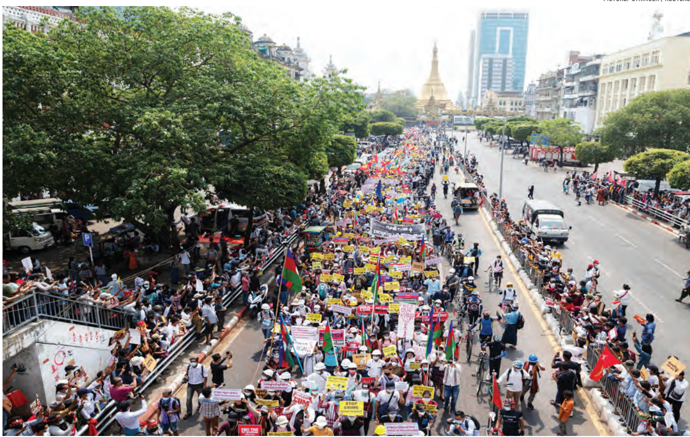
Demonstrators protest against the recent military coup on the streets of Yangon, Myanmar, February 2021.