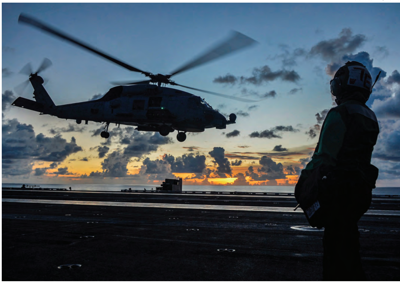
A Seahawk helicopter launches during flight operations aboard the US Navy aircraft carrier USS Ronald Reagan in the South China Sea.

the United States to tackle alone. Another objective of cooperative security is to limit strategic distrust with major-power competitors. China is a formidable competitor but not an adversary, while Russia wants greater status but is willing to engage in arms control. Still, in acknowledging 'extreme competition' with China, vowing to protect Taiwan and allies, and accusing Russia of election meddling, Biden walks a fine line between cooperation and confrontation.