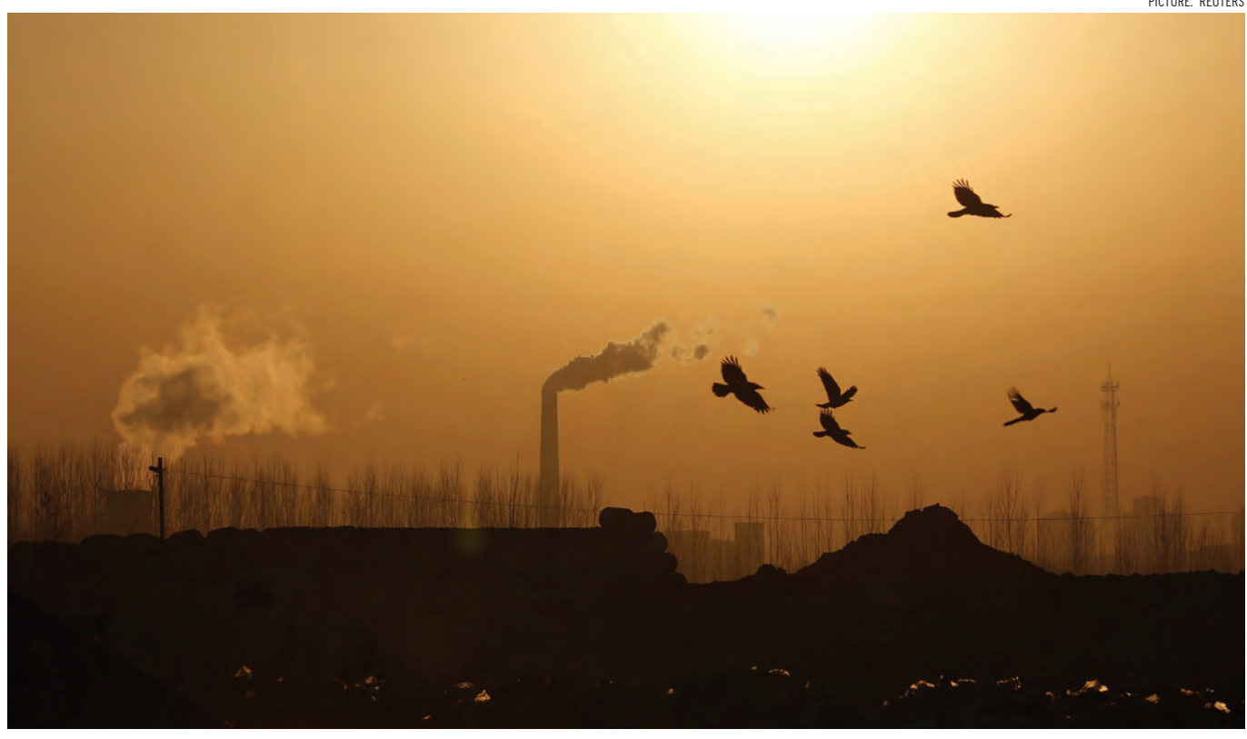
Birds fly over a closed steel factory where chimneys of another working factory are seen in background, in Tangshan, Hebei province, China.

But such modest, bipartisan initiatives are unlikely to satisfy either the demands of domestic climate policy advocates or international calls for action. So the new administration will likely have to opt for regulatory approaches. While this may be an attractive option, using new regulations under existing legislation rather than enacting new laws raises another problem—the courts.