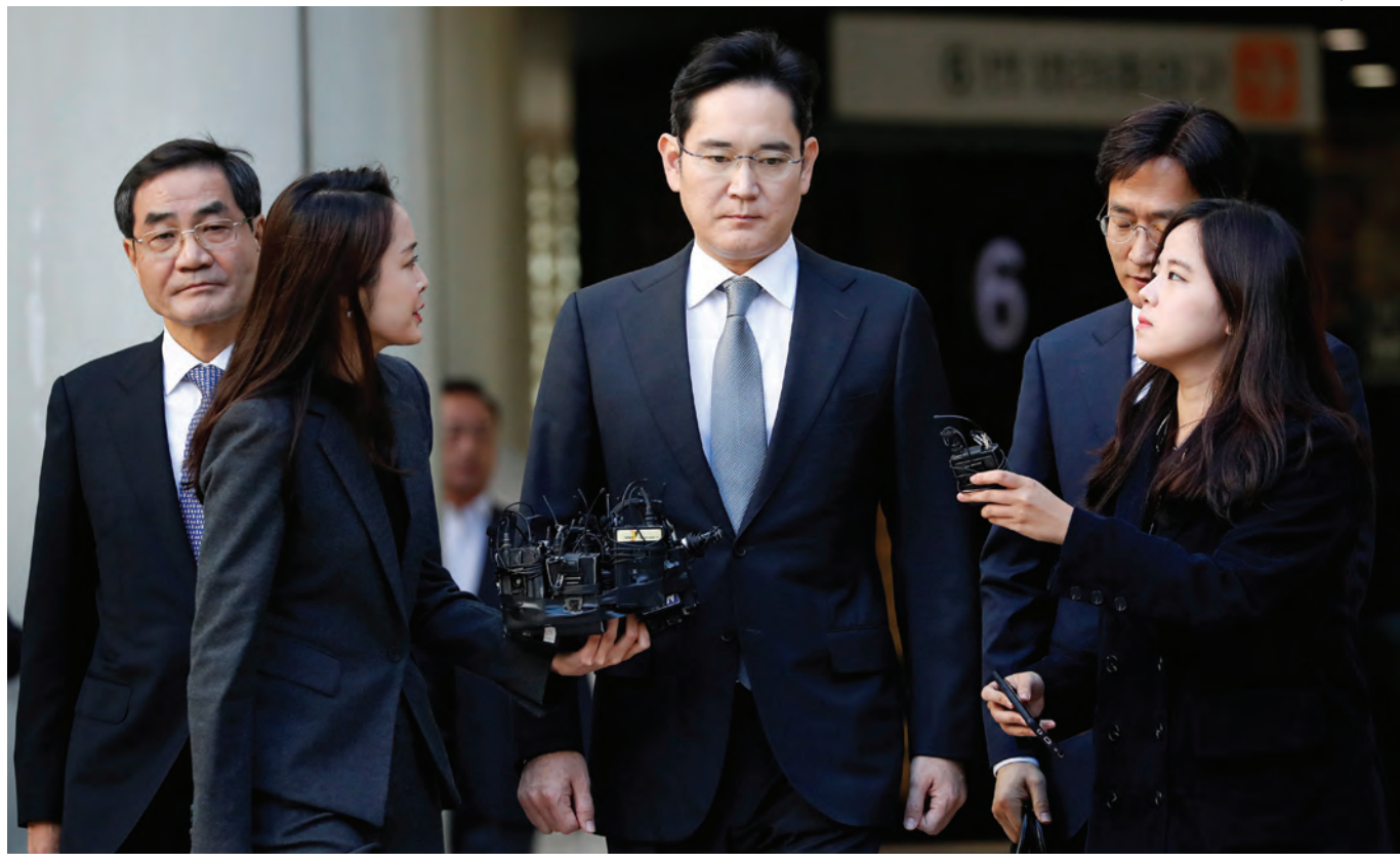
Samsung Electronics vice chairman Lee Jae-yong leaves the Seoul High Court, October 2019.

cent in large primary subcontractors, 3.8 per cent in medium-sized primary subcontractors and 2.8 per cent in small secondary subcontractors. The wage gap between SMEs and large firms is a key contributor to widening income inequality in Korea.