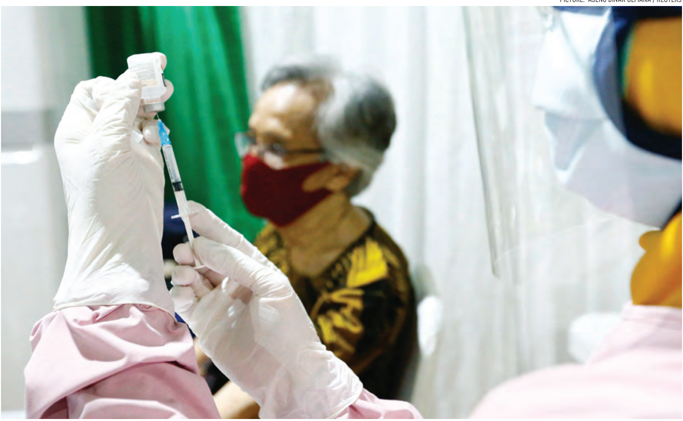
A health care worker prepares a dose of China's Sinovac Biotech vaccine for the coronavirus disease (COVID-19), during a mass vaccination for elderly people at Indonesia's health ministry in Jakarta, March 2021.