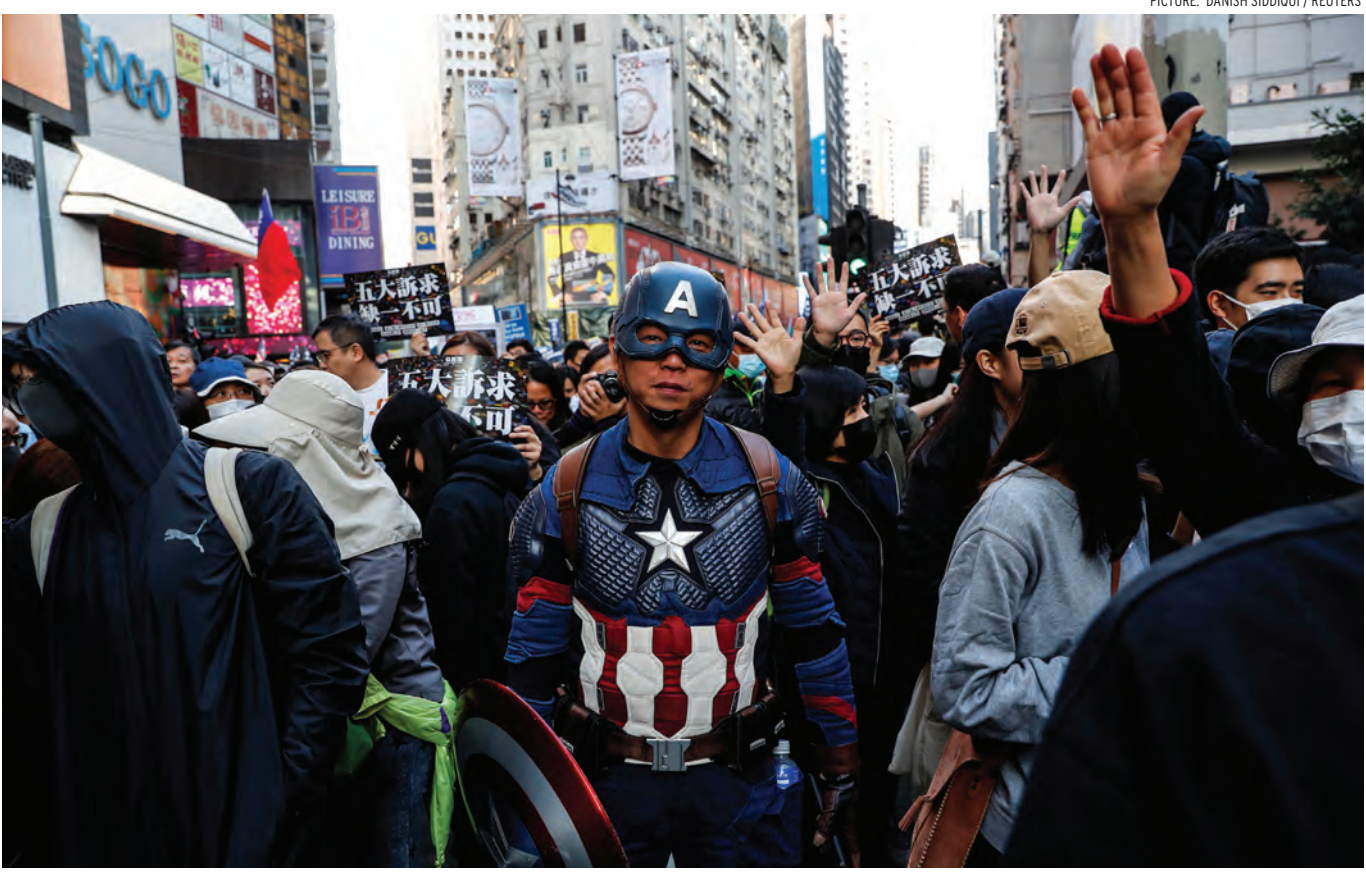
A protestor dressed as Captain America attends a Human Rights Day march, organised by the Civil Human Right Front, in Hong Kong, December 2019.

more deeply into the international system would make it a 'responsible stakeholder,' facilitating its 'peaceful rise' and gradual modernisation into a more politically open—if not entirely democratic—system.