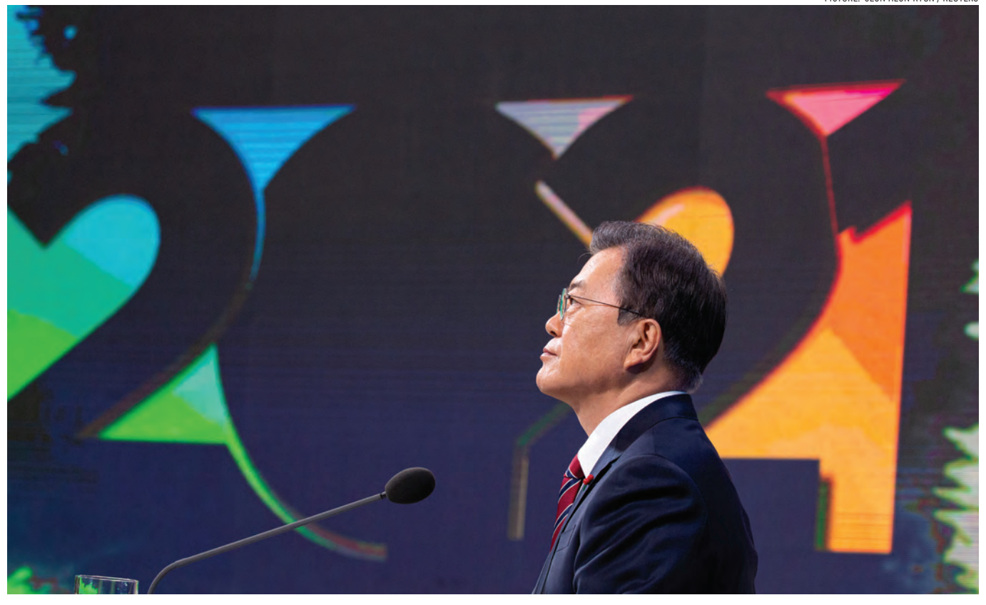
South Korean President Moon Jae-in speaks during an online New Year news conference, January 2021.

Moon's fixation on putting into place a so-called permanent peace regime on the Korean peninsula is all the more urgent given that he will leave office in May 2022. All presidents want to leave legacies that will outlast their years in office and Moon is no exception. But as the world grapples with the worst pandemic in a century, it makes eminent sense for South Korea to look beyond North Korea as the defining element in Seoul's national security and foreign policies. There is every reason to maintain the highest level of vigilance and defencereadiness in the face of growing North Korean nuclear and other asymmetrical threats. But in an era of escalating power competition marked by intensifying US-China rivalries that will cut across all sectors, worsening climate change, unparalleled technological disruptions