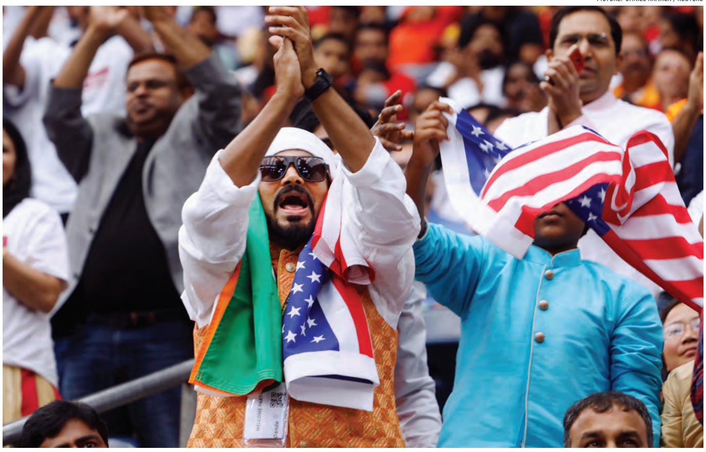
Supporters react during a 'Howdy, Modi' rally celebrating India's Prime Minister Narendra Modi at NRG Stadium in Texas, September 2019.

terror networks on its soil, especially with the receding US footprint in the region making the Afghanistan-focused networks less of a concern for Washington.