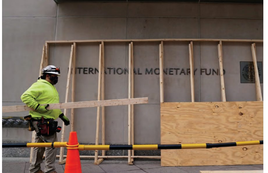
Workers board up the International Monetary Fund building to Biden's presidential inauguration

ncillary but critical to effective health responses: logistics, urban