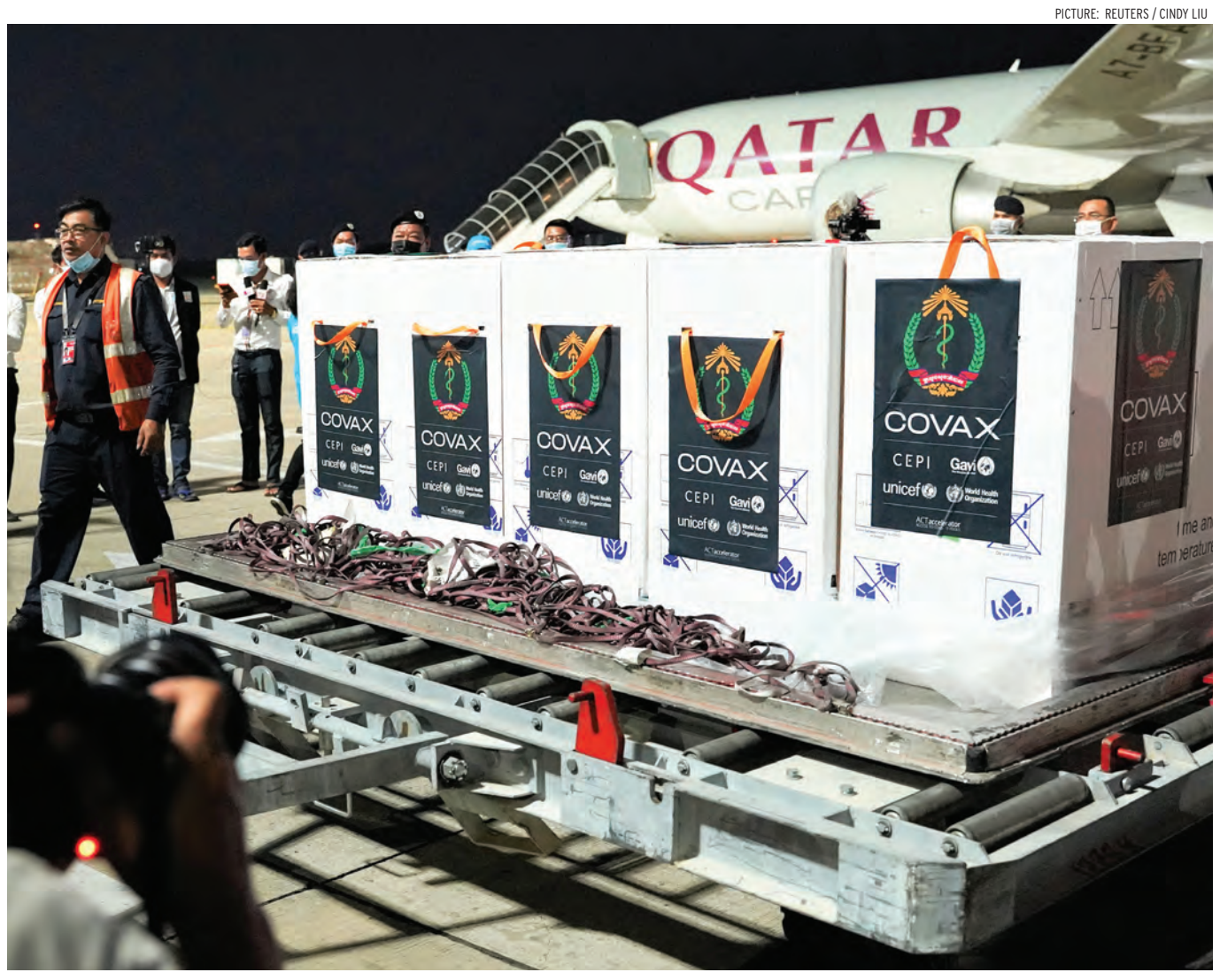
Workers offload boxes of Oxford/AstraZeneca vaccines, distributed by COVAX, at Phnom Penh International Airport, Cambodia 2021.

nationalism and widen vaccine availability. So long as significant portions of the world lack access to COVID-19 vaccines, the pandemic will continue to threaten the globe. Nearly every country in the world has signed on to COVAX's plan, giving a strong boost to its legitimacy and reinforcing the interdependence inherent in fighting global pandemics.