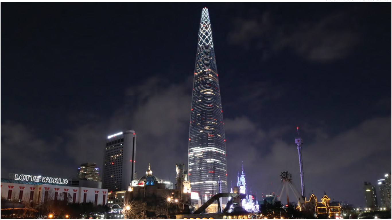
The 123-storey Lotte World Tower building in eastern Seoul epitomises the dominance of large business conglomorates throughout the South Korean economy.