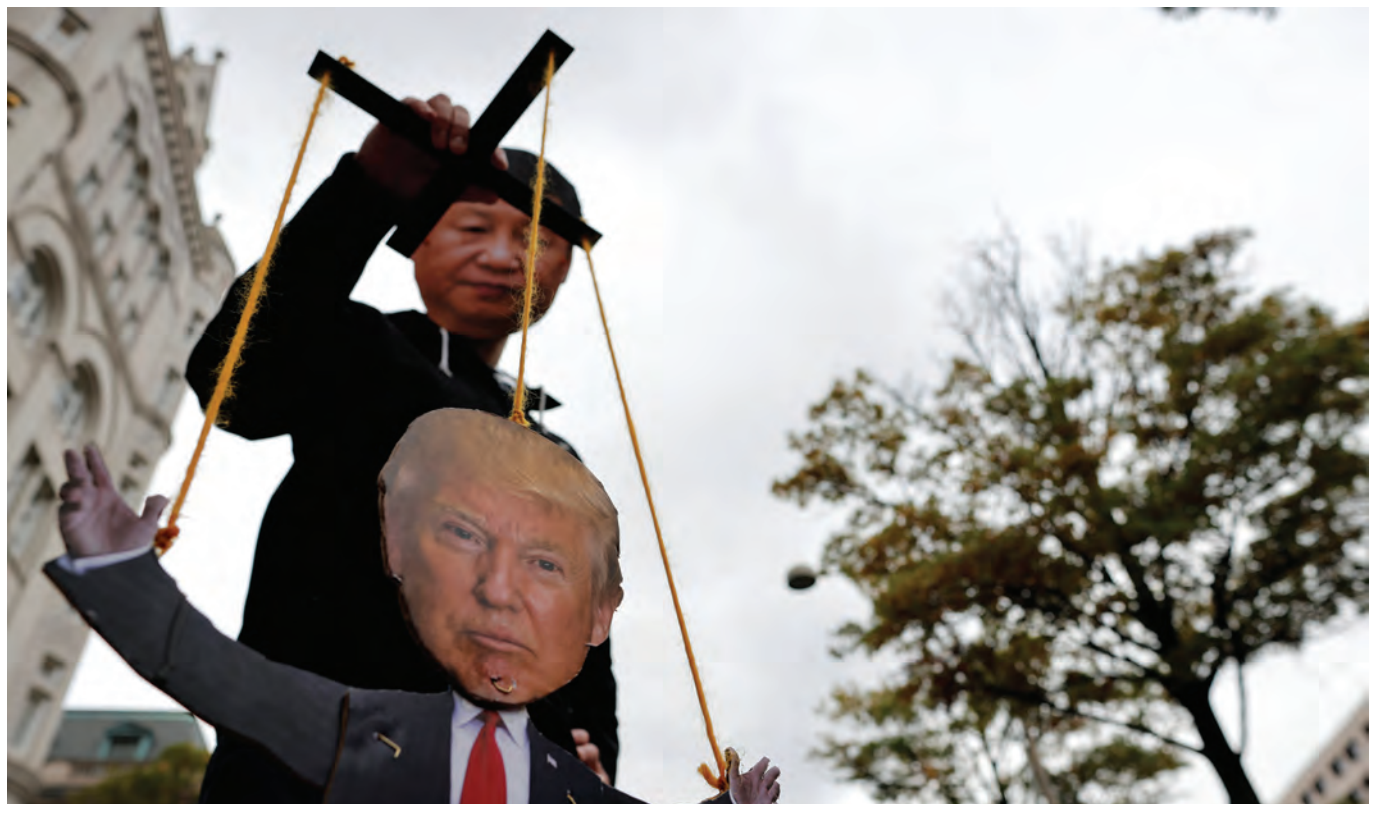
A protester in the guise of President Xi Jinping controls a marionette of president Trump while demonstrating in front of the Trump International Hotel, Washington DC 2020.