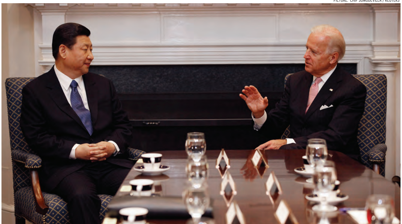
President Xi Jingping and then vice-president Biden met in Washington DC for an expanded bilateral meeting in 2014. It is expected that the new Biden administration will revive a more subtle and productive strategic policy when it comes to engagement with China and its allies in the region.

and China. The inescapable reality is that China's importance to other countries is growing. It is the world's largest trading power and the leading engine of global economic growth. It is becoming more embedded in Asian and European value chains.