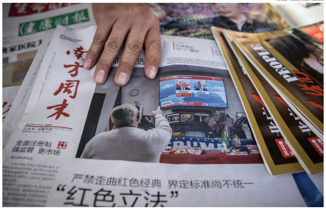
The front page of the Southern Weekly reports on the domestic competition between former US president Donald Trump and President Joe Biden during the November 2020 election.

Washington also argues that the two countries share important interests in other aspects, providing opportunities for cooperation.