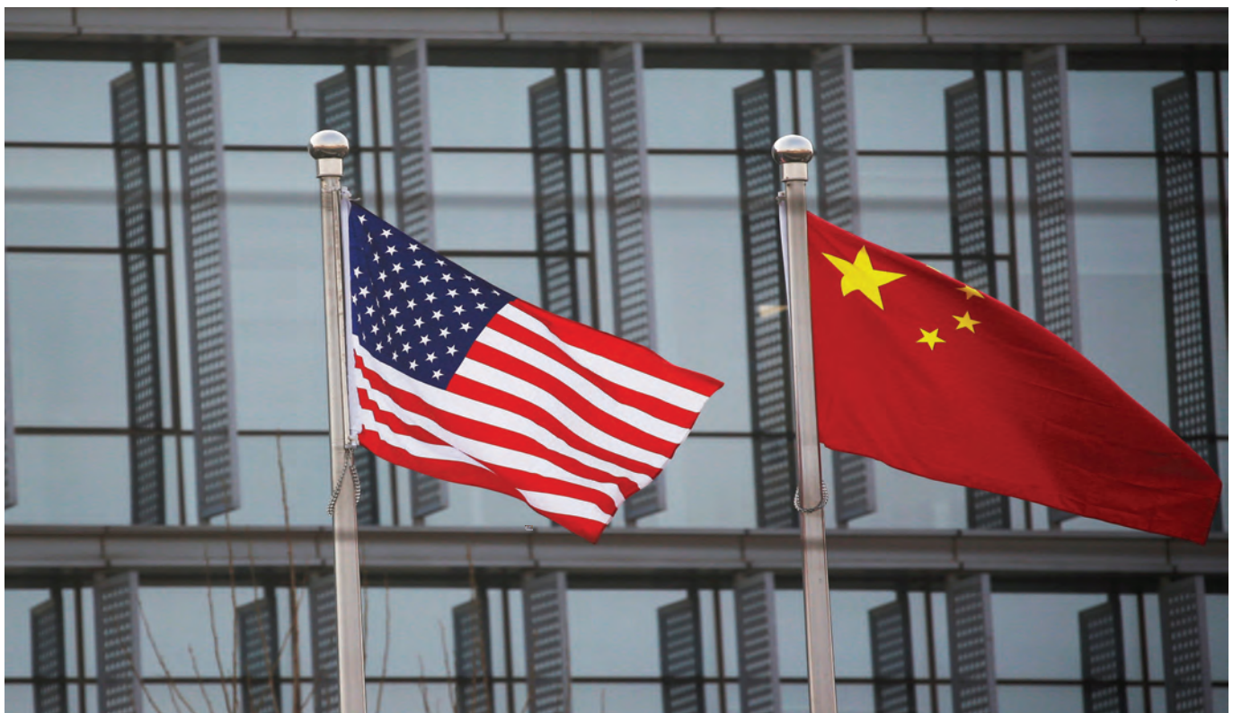
The flags and stakes are raised as the Biden administration balances US priorities in the region with its allies' China relationships.