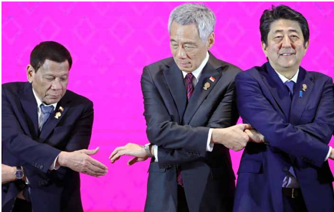
Philippines President Rodrigo Duterte, Singapore Prime Minister Lee Hsien Loong and former Japanese prime minister Shinzo Abe join hands at ASEAN-Japan Summit in Bangkok in November 2019. A number of Southeast Asian countries would be ready to join Japan in advancing principled pluralism.

be excluded from commitment to international commercial standards by virtue of being China. Either a Biden or a Trump administration, however, is likely to be exclusionary of China per se for the time being.