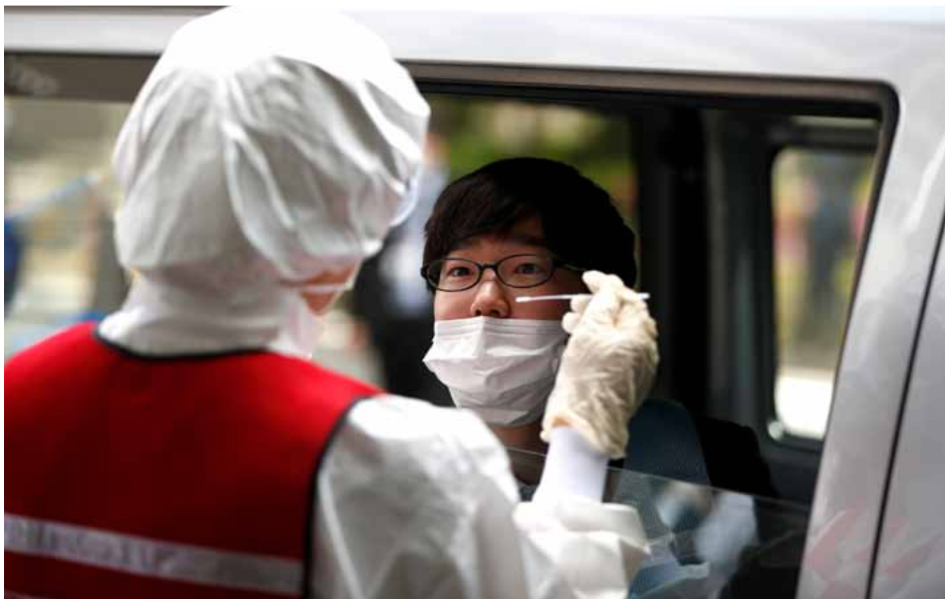
A medical worker conducts a simulation drive-through polymerase chain reaction (PCR) test for COVID-19 at Edogawa ward in Tokyo in April 2020.