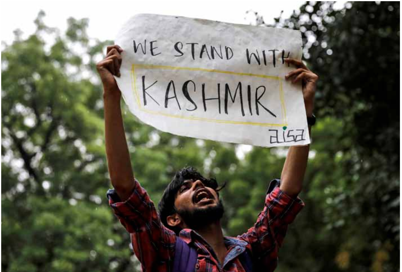
A man in Delhi protests against the Indian government's scrapping of Kashmir's special status in August 2019. India's 'unsatisfactory experience with the workings of the multilateral system, especially with the UN on Kashmir', has seen it rely more on bilateral diplomacy.

immediate neighbours other than China. In a sub-continent of ancient nations, new states and porous borders, the lines between internal and external politics are blurred. It is only natural that India's relations with its neighbours will play into domestic politics.