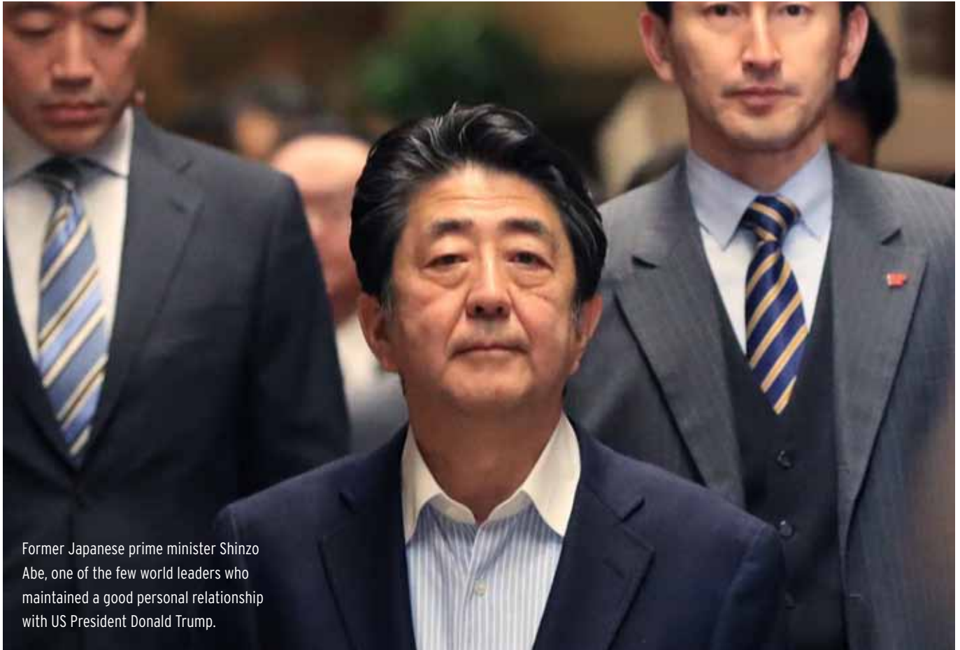
Former Japanese prime minister Shinzo Abe, one of the few world leaders who maintained a good personal relationship with US President Donald Trump.