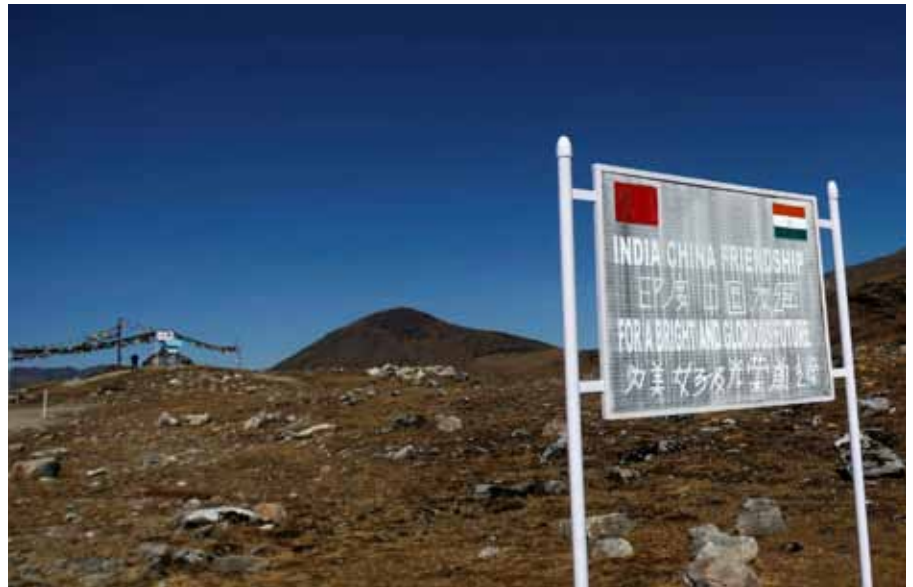
The India-China border at Bumla: the 'bright and glorious future' is clouded by fraught relations.

Today, India's internal politics are being reordered and its economic recovery from the COVID-19 pandemic has taken priority. Domestic impulses, combined with external shifts such as the current tensions with China, will likely push it toward more self-reliance, more selective engagement abroad, the strong defence of sovereignty, and tighter relations