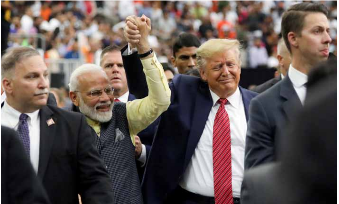
Prime Minister Narendra Modi and US President Donald Trump at a 'Howdy Modi' event in Houston, Texas, in September 2019. At a time when there is more tension in US-China relations, India has lent towards countries 'with which it shares a declared commitment to democratic values and principles'.

of international order, including the Western 'liberal' international order and China's view of the international system. The former lacks a leader while Chinese President Xi Jinping has, over the last two years, spoken about leading international governance reforms—changes on which India will have to take a clearer stance.