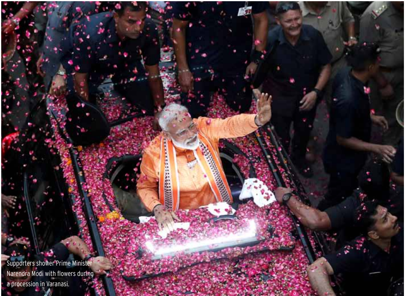
Supporters shower Prime Minister Narendra Modi with flowers during a procession in Varanasi.