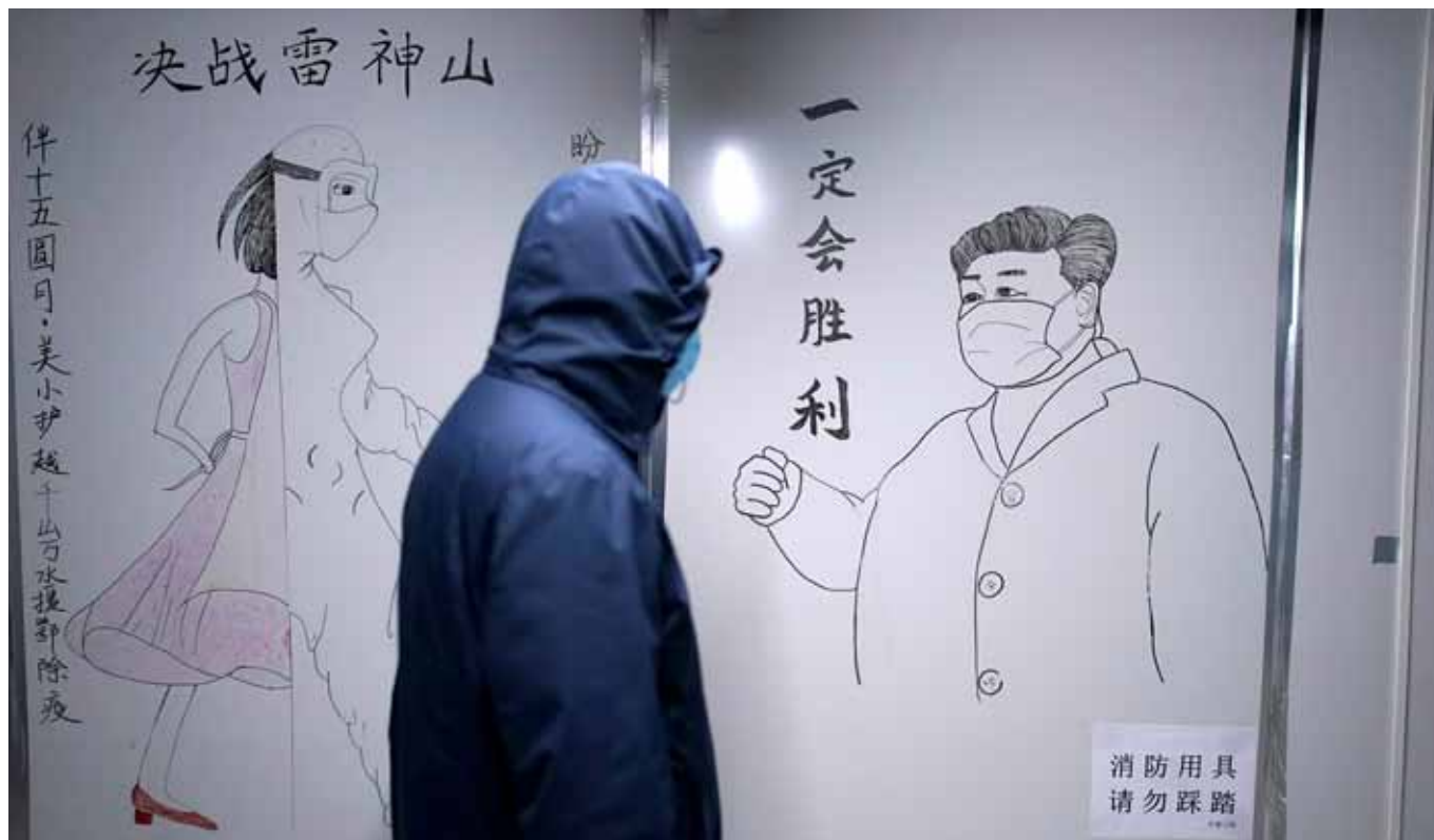
Setting an example: a staff member in protective gear looks at a sketch of masked Chinese President Xi Jinping on the wall of a closed ward in Leishenshan Hospital, a makeshift facility in Wuhan for treating patients with the coronavirus. Xi is 'rather good' at persuading others to do what he wants.

committee. This also appears a greater weight, in representation, than ideology.