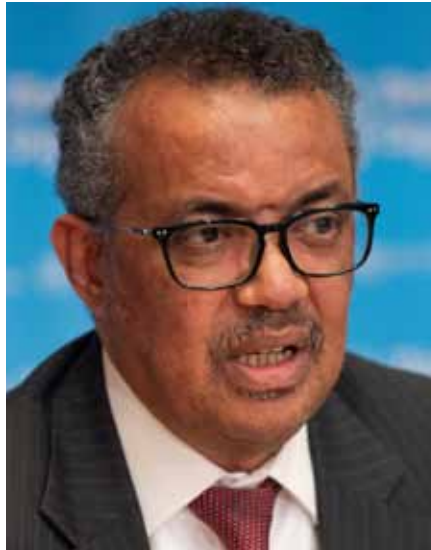
WHO Director-General Tedros Adhanom Ghebreyesus: his agency has become a political battlefield for the United States and China.

Japan is also expected to play a role in pressuring the United States and China to engage in a multilateral framework. US withdrawal from the WHO may enable China to rise in global health governance. Chinese