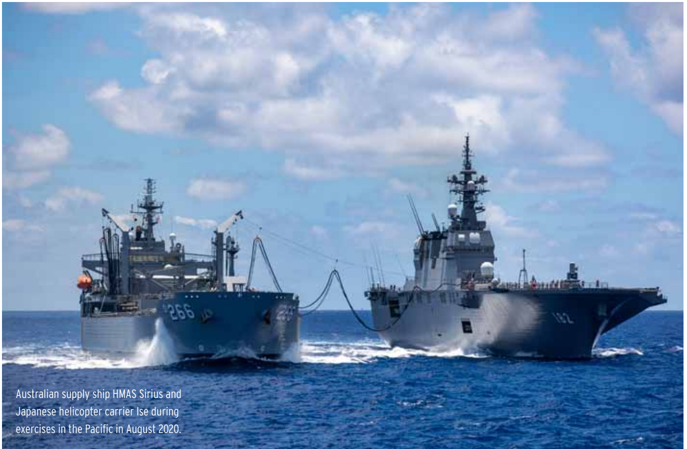
Australian supply ship HMAS Sirius and Japanese helicopter carrier Ise during exercises in the Pacific in August 2020.