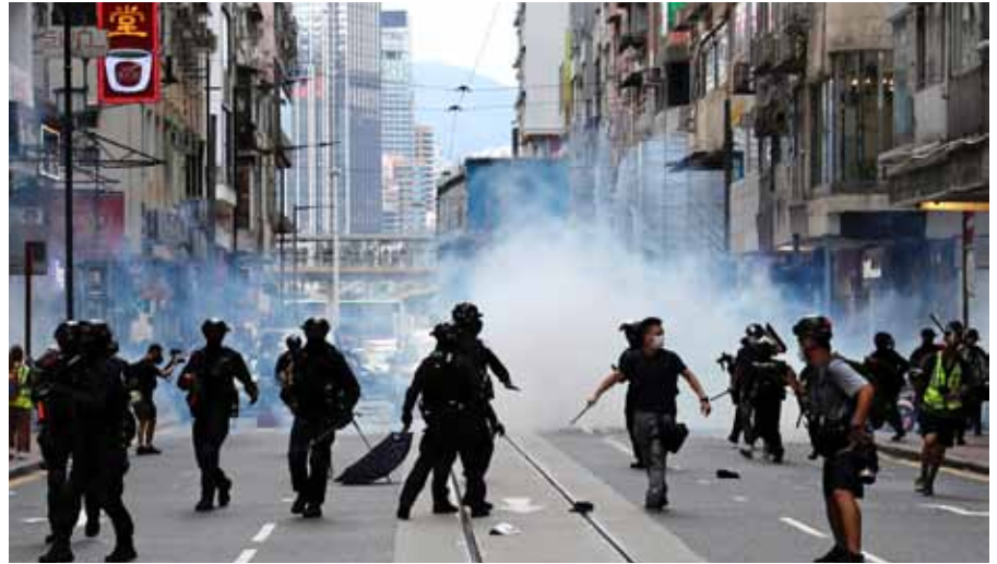
Police fire tear gas at protesters in Hong Kong in July 2020. ‘Artificial’ application of security laws could deter foreign capital and dissuade international companies from using the city as a gateway to China.

First, Japan and the United States must demand that China respect transparency and the rule of law in Hong Kong, which has existed based on British common law under the ‘one country, two systems’ model. The erosion of transparency and the rule of law risks destroying Hong Kong’s