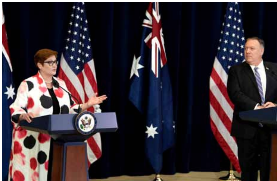
Australian Foreign Affairs Minister Marise Payne and her US counterpart, Mike Pompeo, at the 2020 Ausmin talks. The Australian participants maintained their country's position on China during the talks.

The series of speeches delivered recently by the US National Security Advisor, Robert O'Brien, Attorney General William Barr, FBI Director Christopher Wray and Secretary of State Mike Pompeo went far beyond what Japan expected of the United