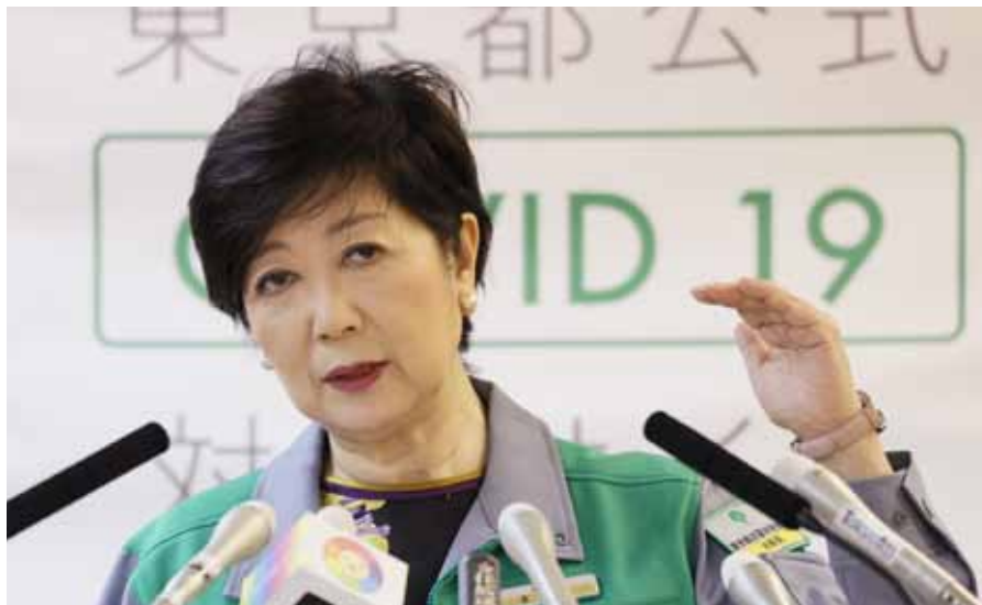
Tokyo Governor Yuriko Koike: quick to explain the COVID-19 situation and urge public precautions.

Indeed, survey research undertaken by Nikkei in April showed