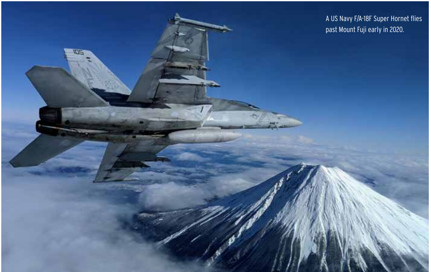
A US Navy F/A-18F Super Hornet flies past Mount Fuji early in 2020.