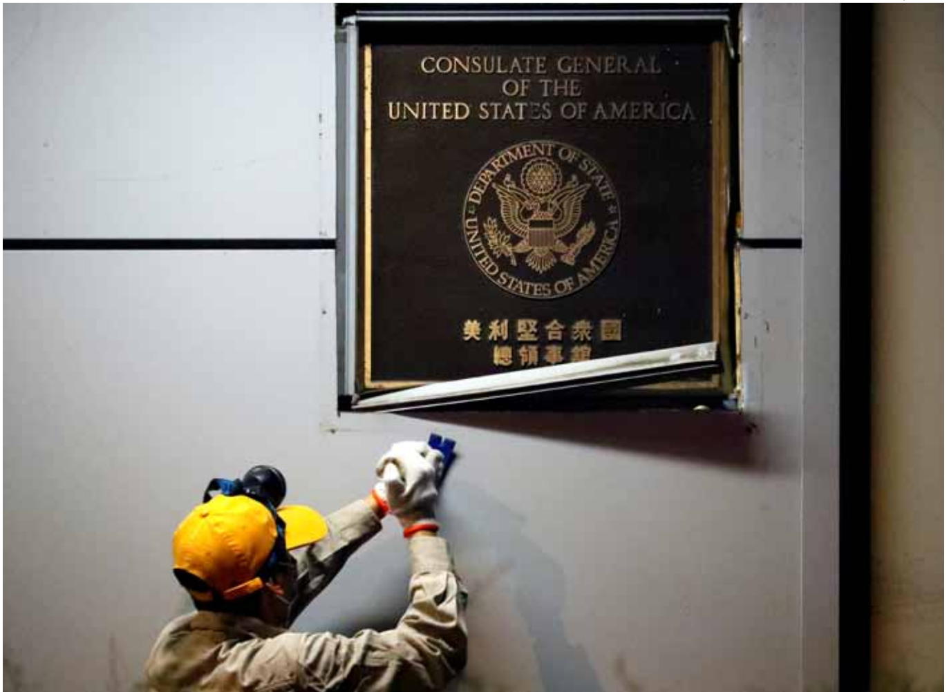
A workman removes the plaque of the US Consulate-General in Chengdu, Sichuan province, in July 2020. Despite some American views, 'it is a fundamental mistake to treat relations with China as an ideological mission rather than seeing China as another great power with a range of views and objectives'.

to encourage large state-owned enterprise.