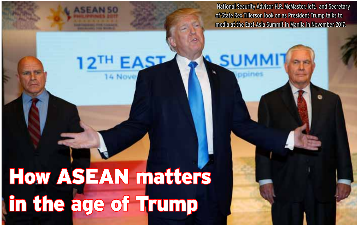
National Security Advisor H.R. McMaster, left, and Secretary of State Rex Tillerson look on as President Trump talks to media at the East Asia Summit in Manila in November 2017.