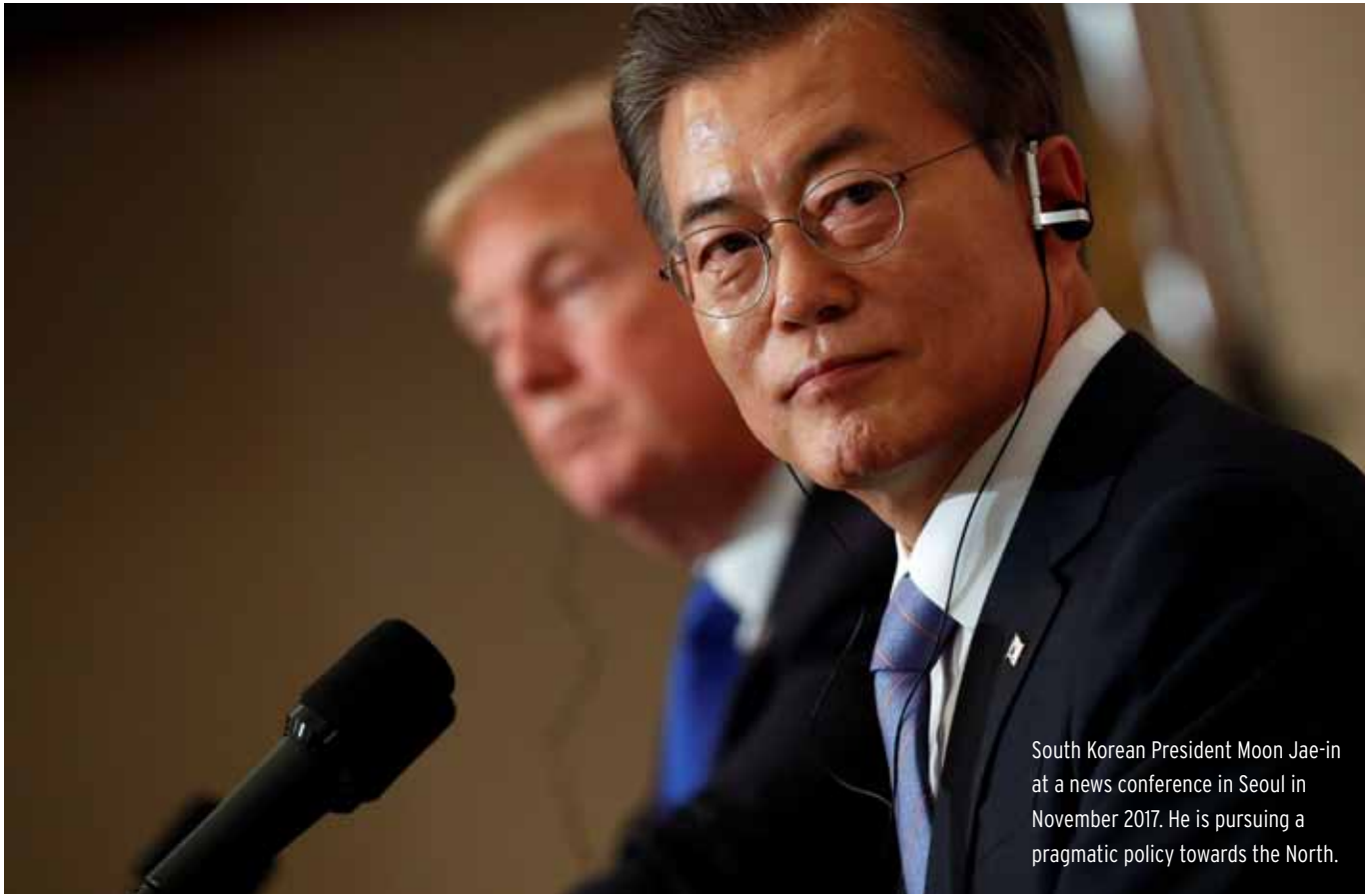
South Korean President Moon Jae-in at a news conference in Seoul in November 2017. He is pursuing a pragmatic policy towards the North.