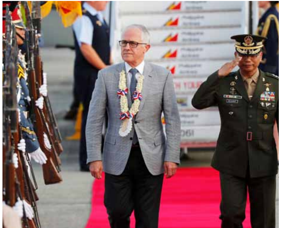
Australia Prime Minister Malcolm Turnbull arrives for the ASEAN summit in Clark, Pampanga, the Philippines, in November 2017. Deeper relations with ASEAN would make Australia 'a less lonely country'.

Second, Australia is in some ways a less attractive partner for ASEAN