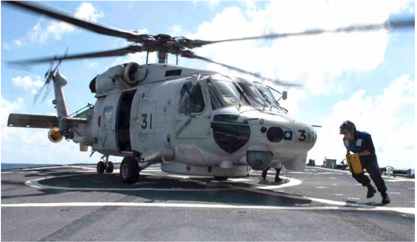
A sailor aboard USS Stethem secures a Japan Maritime Self-Defense Force aircraft during multinational helicopter deck landing practice during the at-sea phase of the ASEAN Defense Minister's Meeting (ADMM) Plus Maritime Security and Counterterrorism Field Training Exercise 2016.