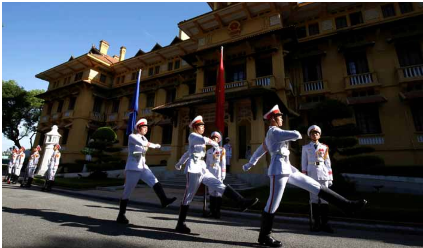
Honour guards march past the ASEAN and Vietnamese flags before Vietnam's Ministry of Foreign Affairs in Hanoi. Vietnam is a vigorous member of the bloc.

increasingly hard to reach 'consensus'. The pending membership application of Timor Leste, if successful, will only lead ASEAN towards even deeper heterogeneity.