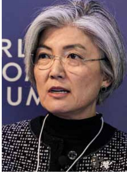
Kang Kyung-wha: military options 'not possible' in resolving the Korean situation.

Expectations of Washington over the next few years need to be lowered. The Trump administration has demonstrated that it has even less capacity than its two predecessors to understand the Korean theatre's broader economic and security