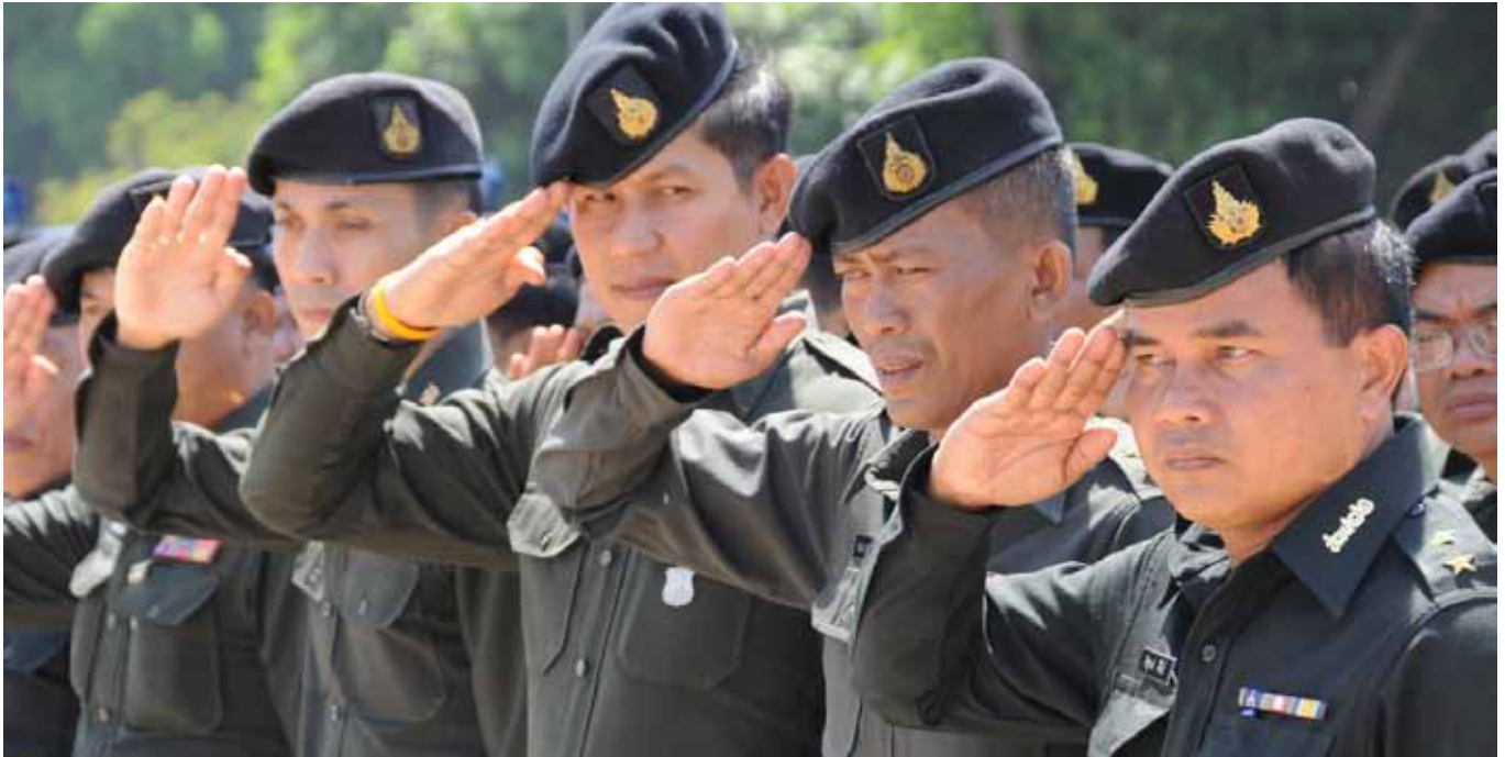
Thai officers on parade. ASEAN 'has remained integral to Thailand's security and is perceived as almost an article of faith'.

Thailand is on a path of integration with the Southeast Asian mainland, including with southern China. The greater interconnectedness with China impinges on member states' perceived freedom of political and economic action.