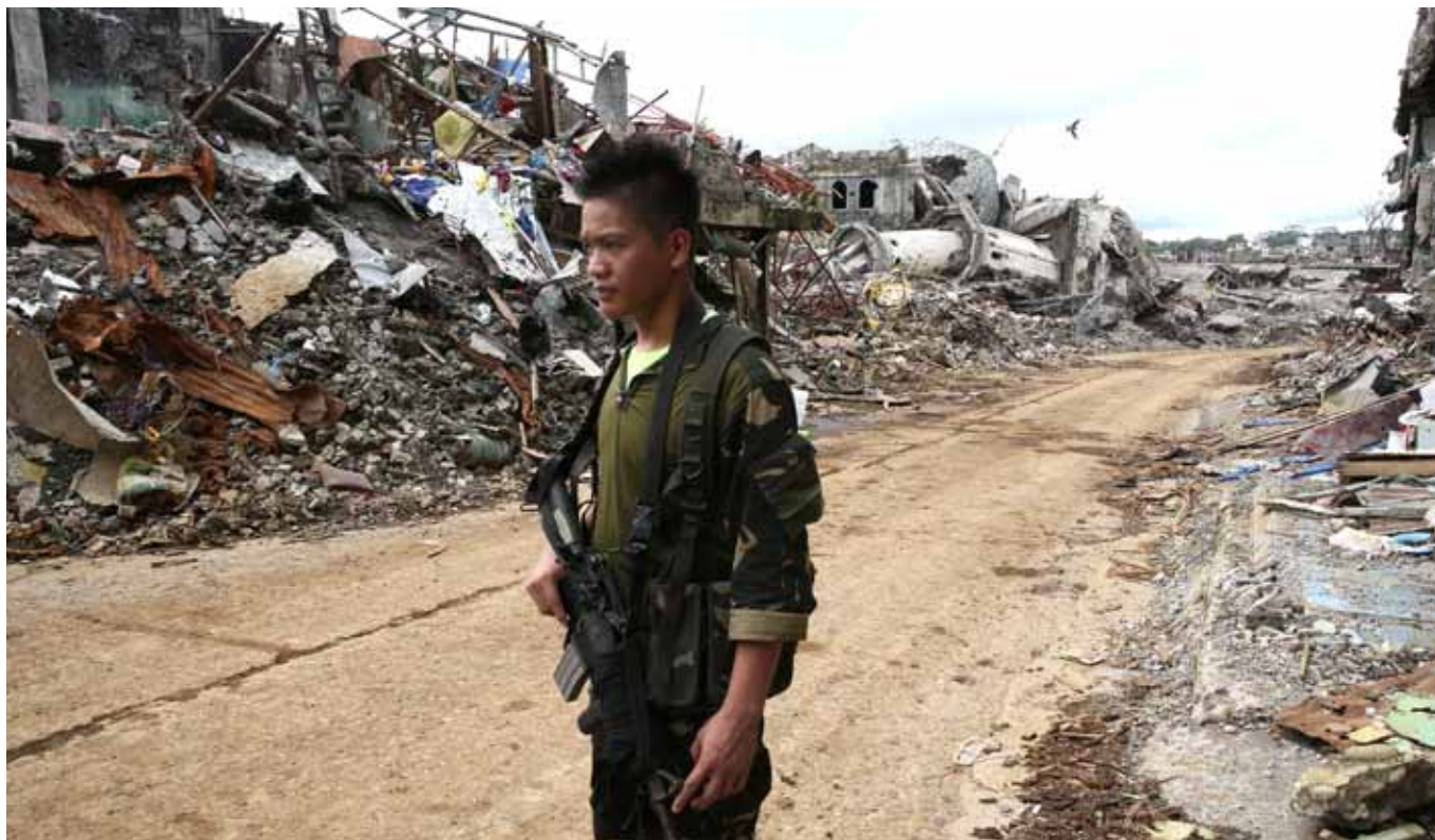
A government soldier stands guard in front of damaged buildings in Marawi city in October 2017. The conflict there 'cannot simply be considered a local issue'.

concluded a three-year program in 2017 to enhance the counter-terrorism capacities of ASEAN member states. Such initiatives must be expanded.