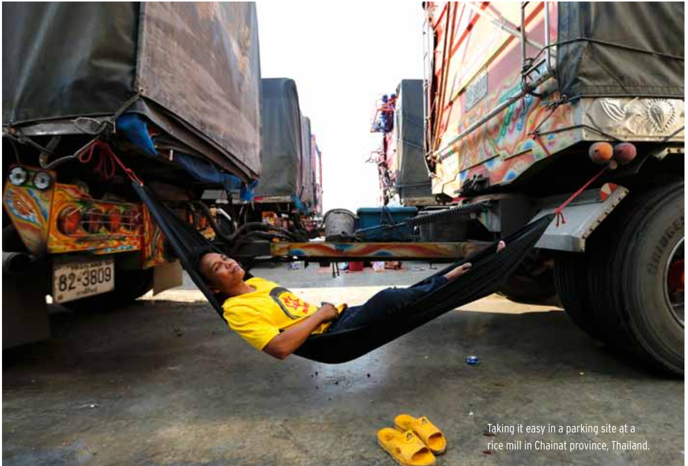
Taking it easy in a parking site at a rice mill in Chainat province, Thailand.