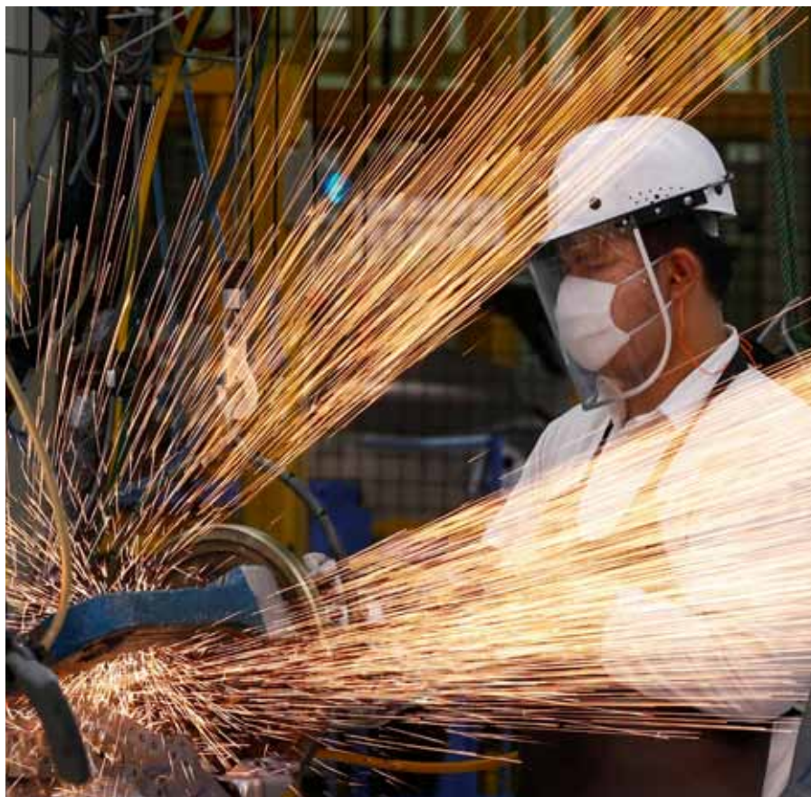
An assembly worker in the vehicle production line of the Honda plant in Prachinburi, Thailand. The rapid growth of trade has made ASEAN the fourth-largest exporting region in the world.

In the original design of the ASEAN Investment Area the bloc flirted with the idea of providing preferential treatment to investors from member countries, but it quickly abandoned the idea and reaffirmed its commitment to a non-discriminatory and open foreign investment regime, mirroring those in